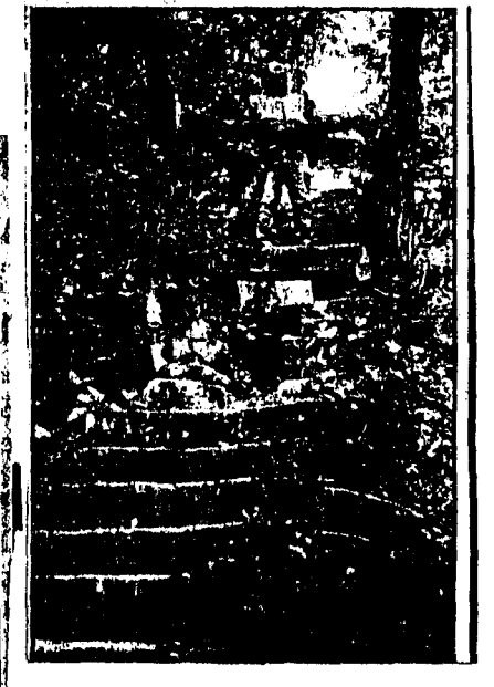
The 60 stone steps that lead from the furnace to the top.