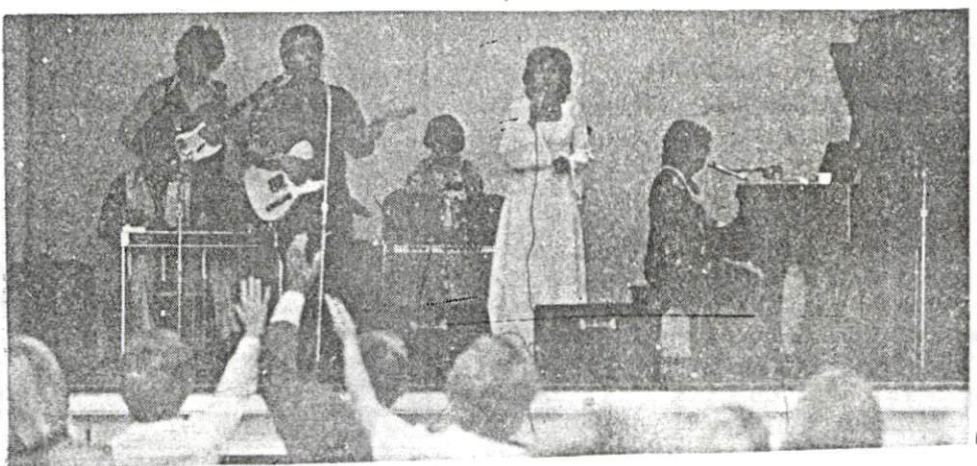
The Cook Family Singers recently made a live recording during a weekend service at Glasgow, Kentucky.