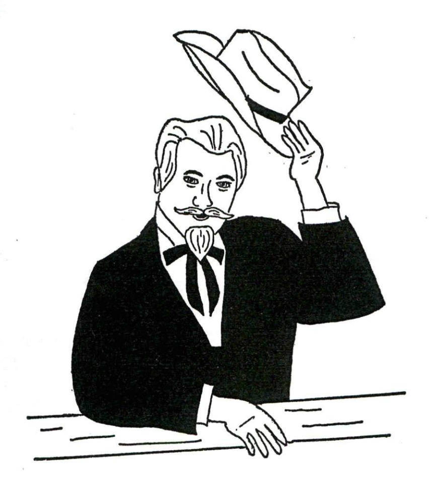
AMERICAN BUSINESS WOMEN'S ASSOCIATION KENTUCKY COLONEL CHAPTER Bowling Green, Kentucky