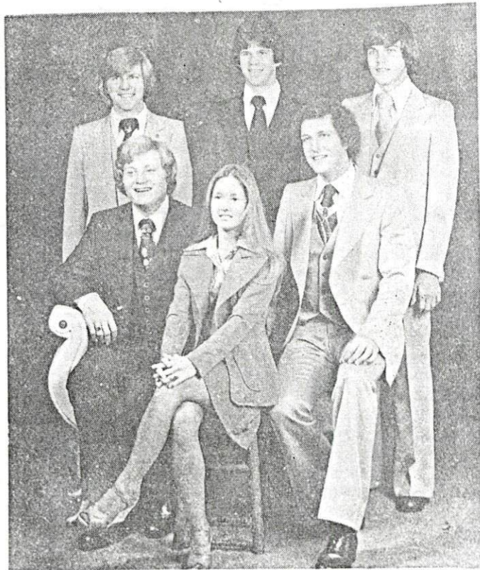
The Seekers will be singing at The Calvary Church of The Nazarene 1142 Caywood Dr. Lexington, Ky. on Feb. 12 at 9:45 a.m. and 7:30 p.m. Everyone is invited to attend.