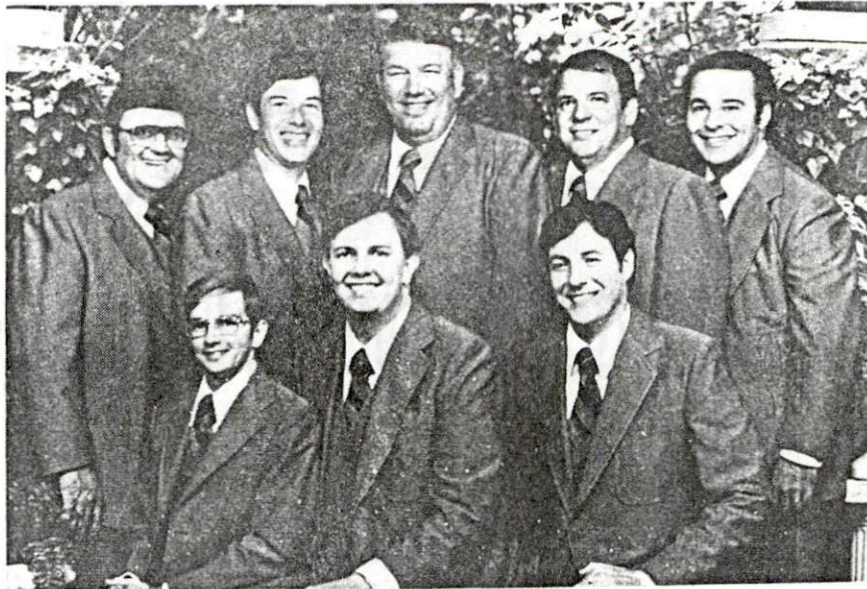
The Kingsmen Quartet