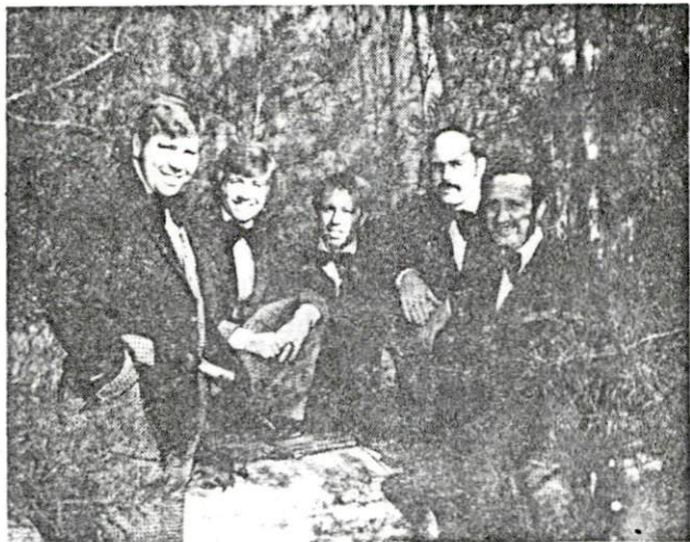
THE TOMES FOUR