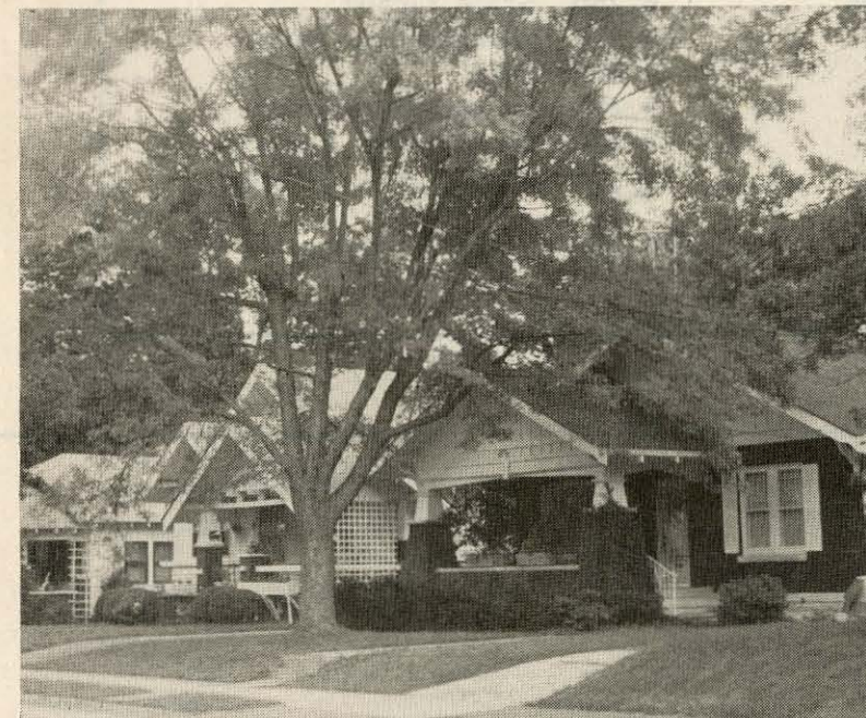
View of 1000 Block of Magnolia Street

The nomination for National Register listing for the proposed Magnolia Street Historic District has been completed and submitted to the Kentucky Heritage Council. This new district comprises the 1000 and 1100 blocks of Magnolia Street between Broadway and Tenth Street. The area is an intact collection of Bungalows built between 1920 and 1925. In all there are 30 houses of the popular Bungalow style built on part of the old Fairgrounds property.