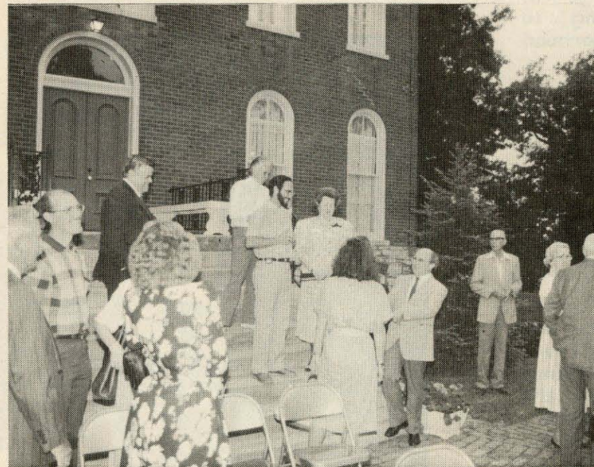
Annual Meeting of the Landmark Association held May 18 at Historic Hobson House.