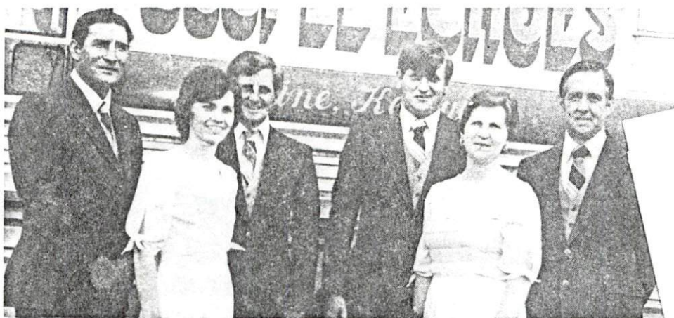
The Gospel Echoes of Irvine, Ky. have joined Gospel Reaching Out. We welcome this group to our family. A list of their dates can be found on page 5