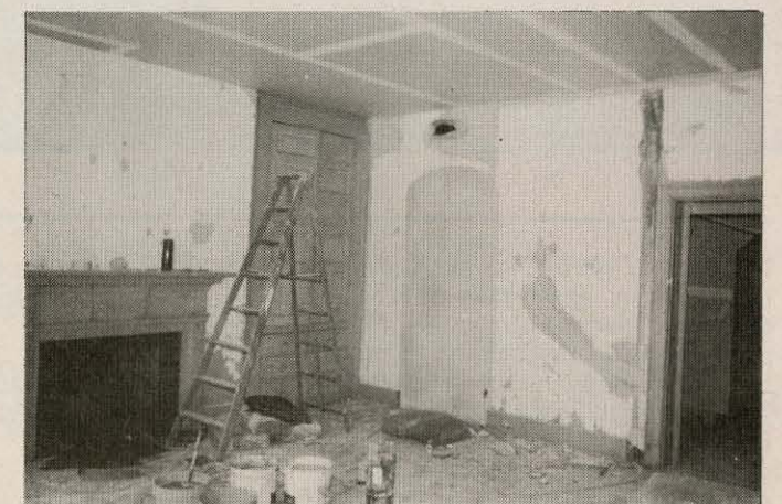
Second Floor of Townhouse - Master Bedroom Under Construction