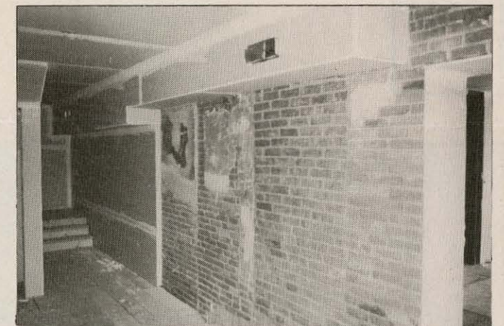
First Floor of Townhouse - Kitchen Under Construction