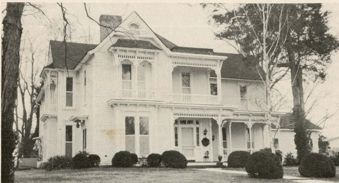
Recently rehabilitated exterior of Walnut Lawn