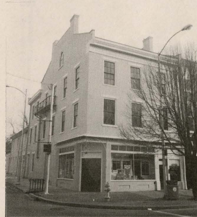
Quigley-Younglove Building, 900 State Street completed Exterior