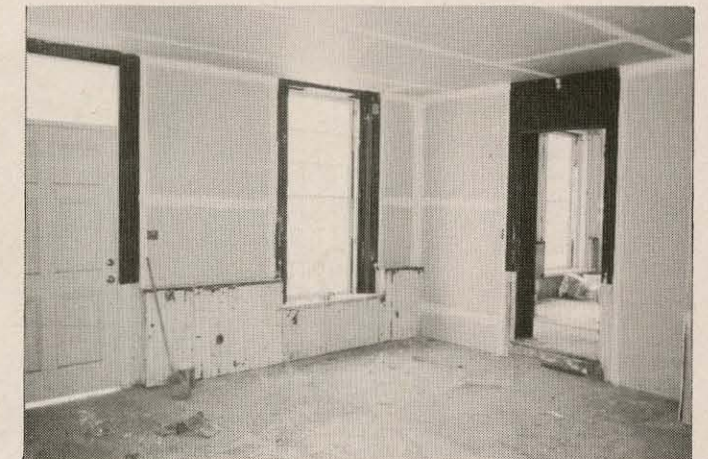
First Floor of Townhouse - Living Room Under Construction