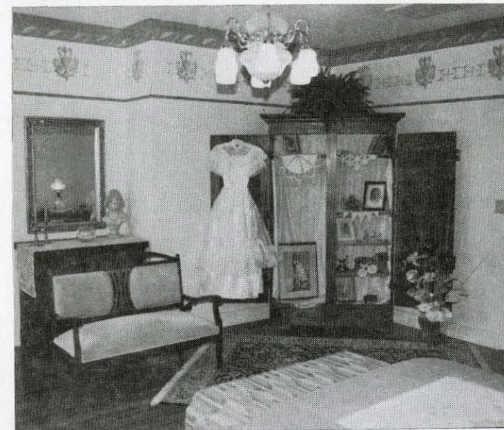
View of middle bedroom on the second floor of the townhouse.