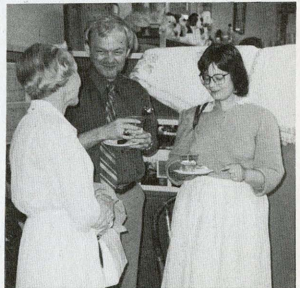
Part of the Annual Meeting crowd of 75 enjoying the reception at the Quigley-Younglove Building - location of the 1988 Decorator Showcase.