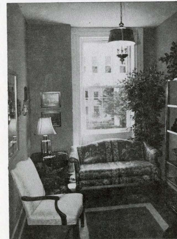
Second floor office space.