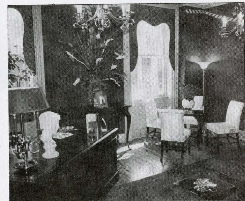
Second floor office space.