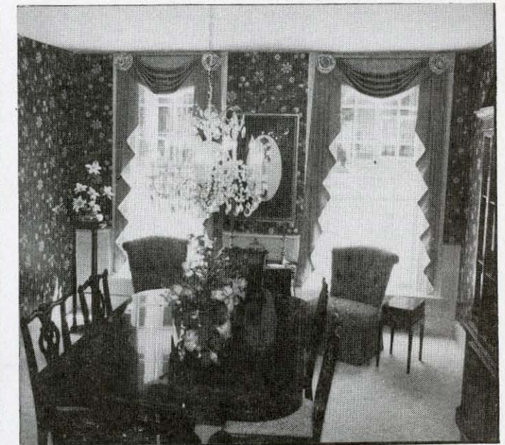
View of the first floor dining room of the townhouse.