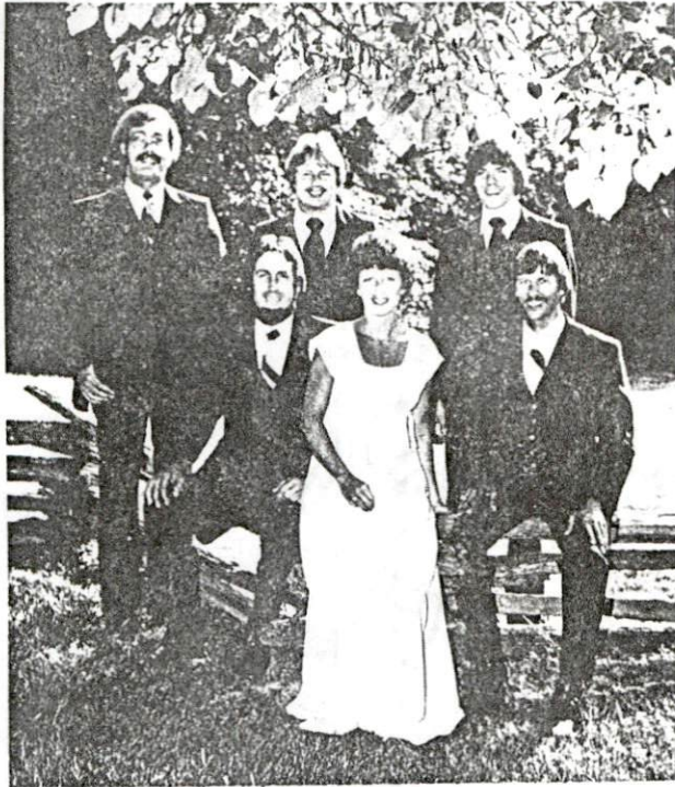
Come And Be With Us This Special Day.