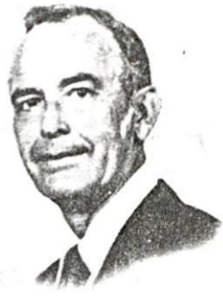
The Chuck Wagon Gang