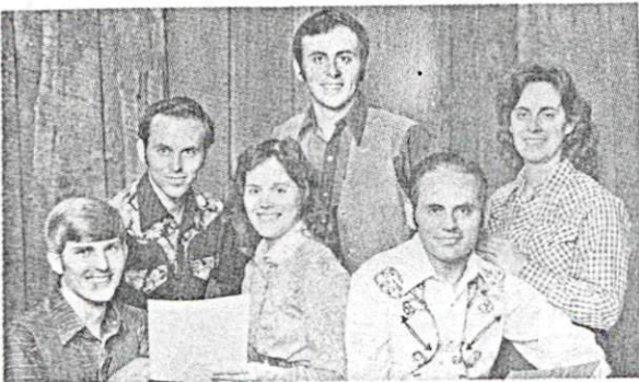
The Spencer Family

To order send $6.00 for Record, 8 track or cassette or Ask for it at your bookstore.