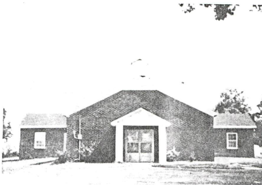
Old Bethel Bible Church Alpha, Kentucky Pastor, Earl Wooten