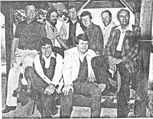
THE NEW RANGERS