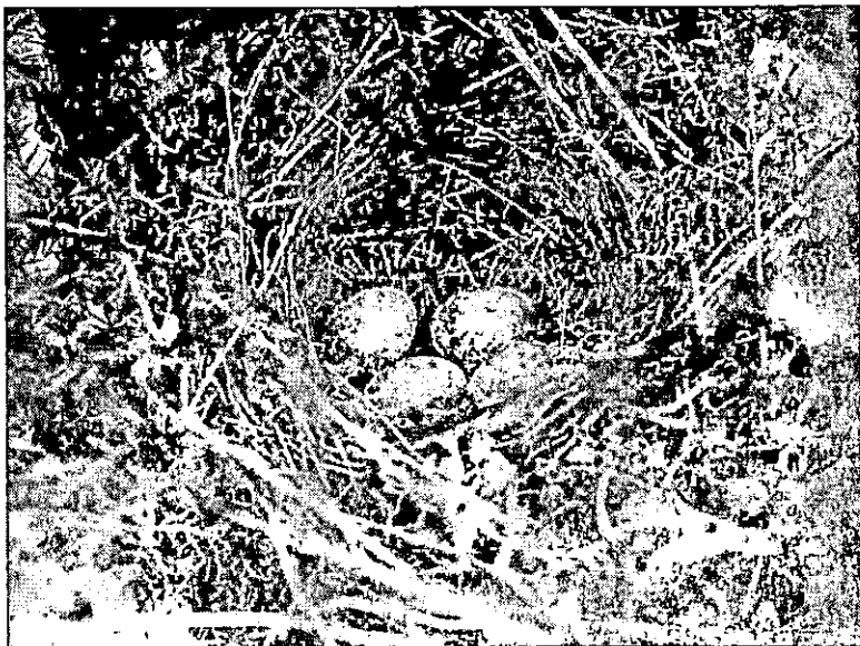
Nest of Eastern Towhee in red cedar.

INDIGO BUNTING , Passerina cyanea . Common summer resident in the new growth. A nest with 3 eggs was located on July 15, 1945, in a small bush only 15 inches from the ground, along the path