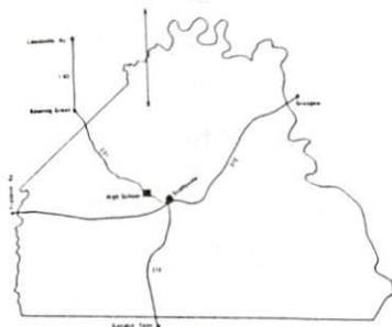
LOCATION ALLEN COUNTY