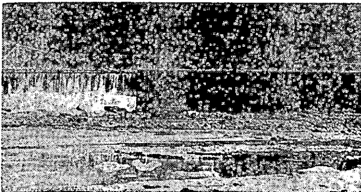
American Egrets Sunning Themselves Below the Dam