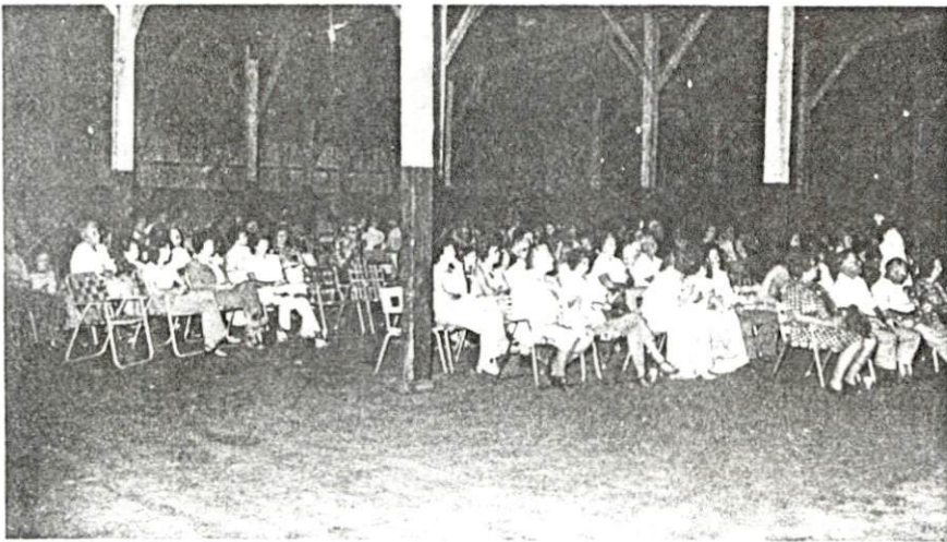
LARGE CROWD ATTENDED LAST YEAR

The Hart County Gospel Music Association board met recently to make plans for their Annual May Singing to be held in Horse Cave, Kentucky.