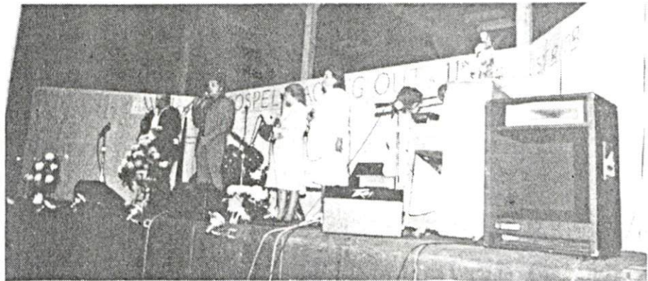
The Gospel Lamplighters from Rock Field, Ky., near Bowling Green, Ky. At May Singing.

The Hart County Gospel Music Association celebrated their 11th anniversary on May 13 and 14 with two of the most successful singings in the history of Gospel Reaching Out. A large crowd attended each evening and a number of good gospel groups participated. Door prizes were given away and everyone seemed to enjoy the singing very much.