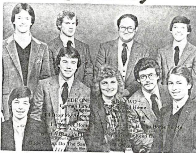
The Barry Clardy Singers and The Canaanland Singers

Recorded and manufactured by WES Sound Studios, Asheville, N.C.