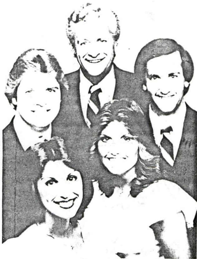
The Rex Nelson Singers

The Rex Nelson Singers will be featured at the National Quartet Convention. They are currently the No. 1 mixed group.