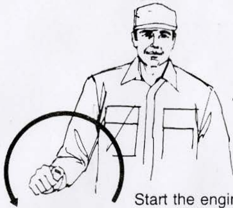
Start the engine.