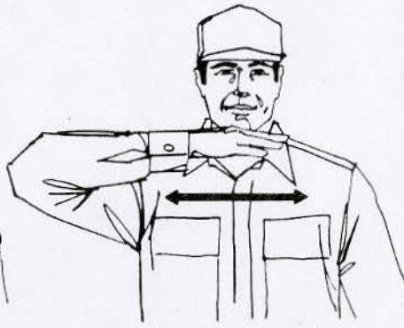
Stop the engine.