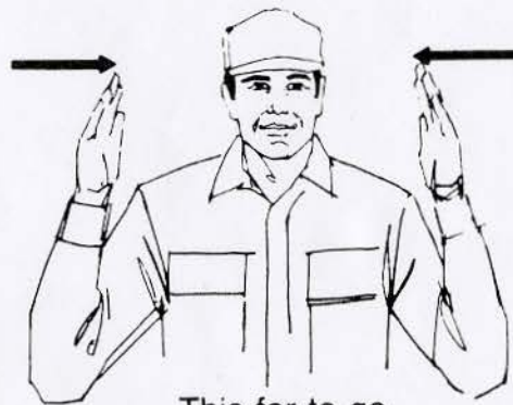
This far to go.