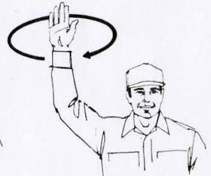
Come to me.