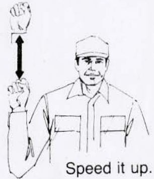
Speed it up.