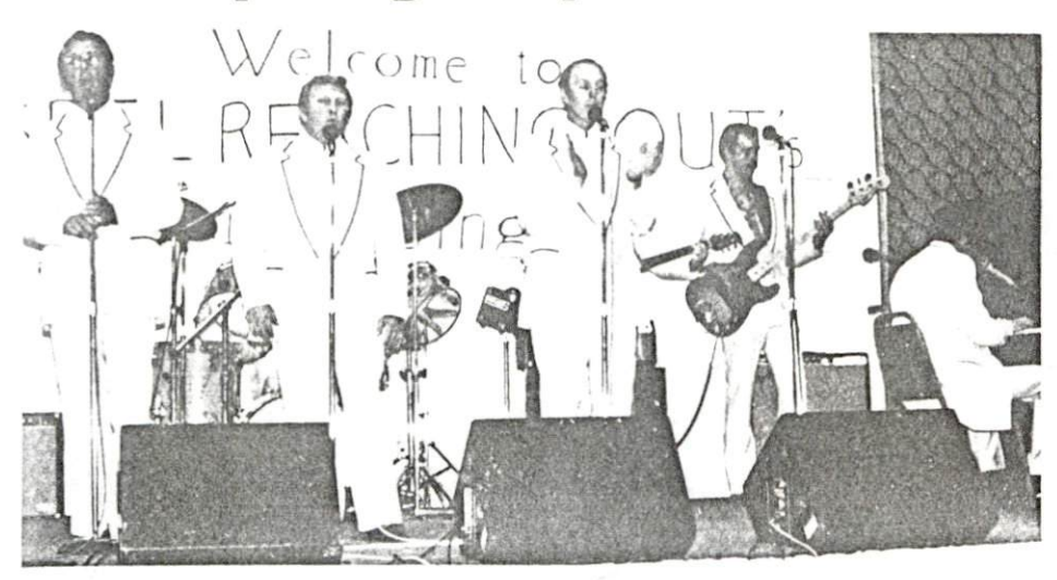
The Edmonton Quartet help furnish sound and song both nights.

The 12th Annual May Singing was held at the Cave City Convention Center on May 25 and 26. Large crowds attended each evening with 425 on Friday and 500 on Saturday. There were ten singing groups on Friday and ten on Saturday.