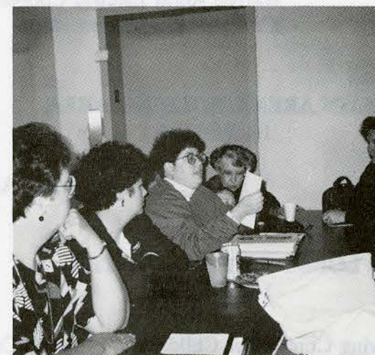
Funded by W. K. Kellogg Foundation in Cooperation with The University of Kentucky and Western Kentucky University

*Initiated the signing of a joint proclamation by the Mayor of Bowling Green and the County Judge Executive declaring the week of September 18-24, 1994 as National Farm Safety and Health Week. (Warren Co.)