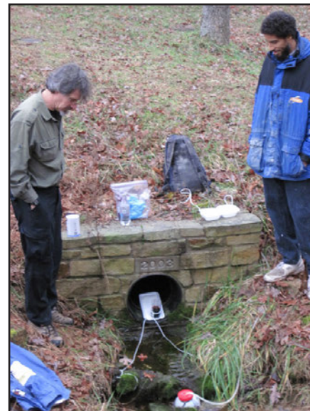
Figure 3: A National Park Service scientist and a TSU student prepare a simple dye-release system for a tracer study.