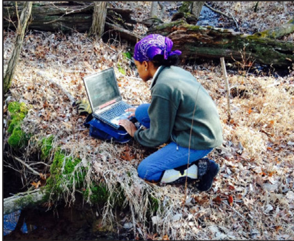
Figure 2: A TSU student downloading data from a monitoring device as part of a tracer study that examined flow from the surface into the caves.