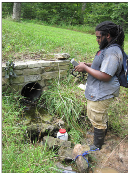
Figure 1: A TSU student setting up a storm monitoring station at the Mammoth Cave National Park Post Office parking lot.