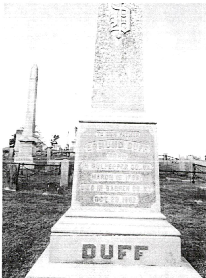
DUFF MONUMENT GLASGOW MUNICIPAL CEMETERY