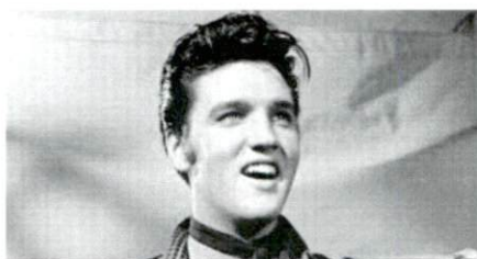
ELVIS PRESLEY IS MY 3 RD COUSIN!!! and other genealogy dreams