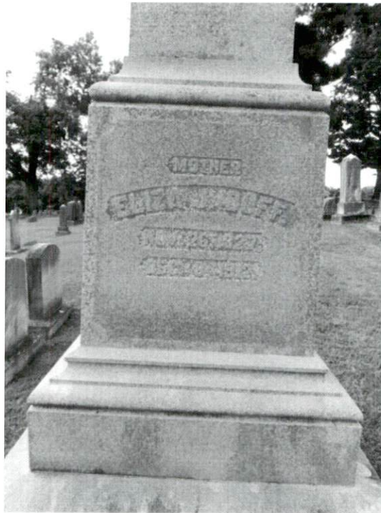
Back side of Duff Monument Glasgow Municipal Cemetery – Glasgow, KY