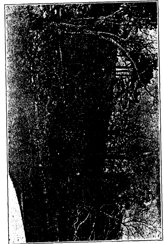
Scene Near School, on Red River.