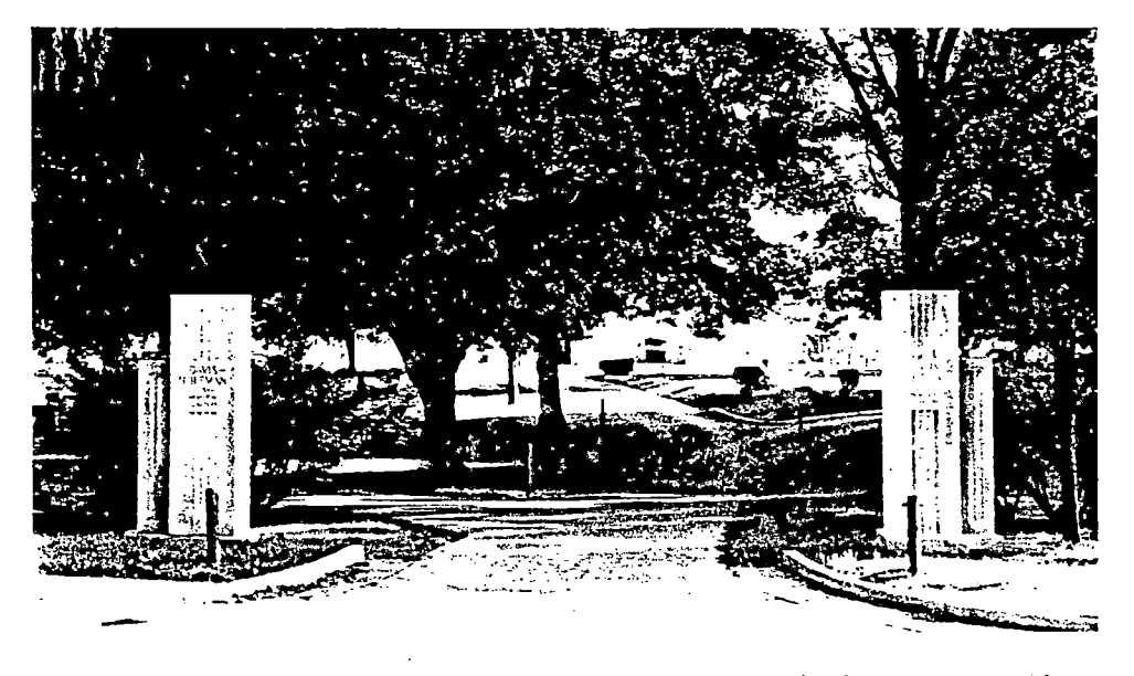
ENTER DAVIS- HOFFMAN MILITARY CEMETERY