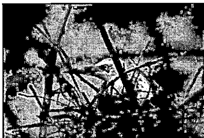
Cattle Egret incubating L. Barkley, Lyon 2 June 2004