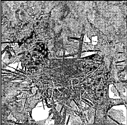
Little Blue Heron incubating Lake Barkley, Lyon 3 June 2004 Tom Fusco

Shore WMA, Greenup , 8 July (SM) and 2 at Casey Creek embayment of Green River Lake, Adair , 10 July (RD); as usual, numbers of post-breeding birds were highest in the w. part of the state and included up to ca. 150 on a slough near Sauerheber 13/21 July (NR); 200 in w. Fulton 22 July (HC, ME) and 300 at Mitchell Lake 23 July (SR).