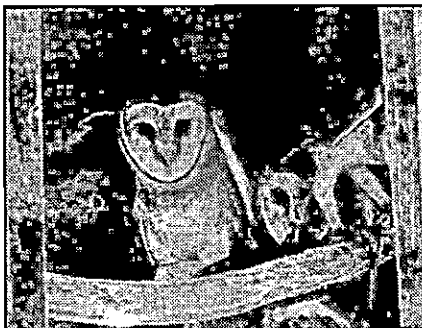
Barn Owls (3 of 5 yg.), Carlisle mid-July 2004 Hap Chambers

Black-billed Cuckoo – only report for the period was 1 in n. Livingston 18 June (BP).