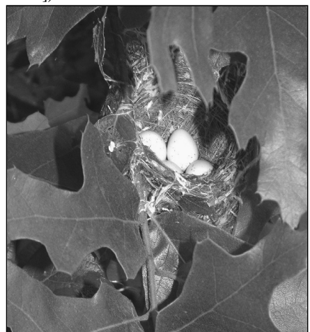
Bell's Vireo nest, Livingston 1 June 2006 B. Palmer-Ball, Jr.

Bell's Vireo – an active nest with 4 eggs n. of Grand Rivers 1 June (ph. BP) and another with 4 eggs along Atkinson School Sedge Wren - there were several reports of Road, n. Christian, 8 June (BP) represented county-firsts for confirmed breeding; also of interest were 2 m. singing along Orange Grove Church Road, se. Hopkins, 2 June (BP) and 2 active nests at Camp #9 (1 with a large cowbird chick 20 June [ph. BP; see p. 92] and 1 with 3 yg. 5 July [BP, Eastern Bluebird – quite unusual was the JB]).