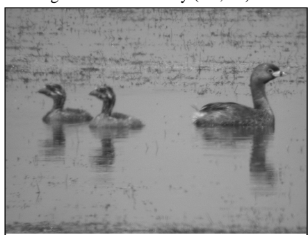
Pied-billed Grebe family, Union 20 June 2006 B. Palmer-Ball, Jr.

Pied-billed Grebe – ca. 10 ads. plus family groups of 3 and 3 chicks being fed by ads. were observed at Camp #11 on 20 June (BP); several family groups were also recognizable there 5 July (BP, JB).