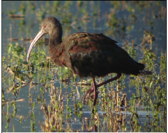
White-faced Ibis, Henderson 12 October 2009