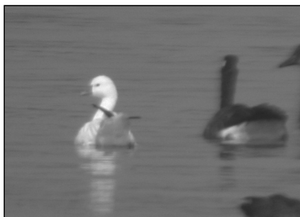
Ross's Goose, Falls of the Ohio 26 August 2009

Ross's Goose – 1 at the Falls of the Ohio 26 August (ph. BP, ph. EH) represented an early date for the state by two months. The only other report was for 1 in the nearby Portland Canal, Jefferson , 30 November (DS, vt. TBe).