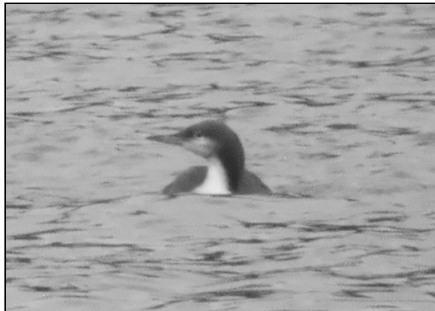
Pacific Loon, Barren River Lake 13 October 2009 David Roemer

Ruddy Duck – 4 at Hebron, Boone , 10 October (LM); 1 at Twin Lakes subdivision, Pulaski , 15 October (RD); and 2 on Honker Bay 20 October (HC, ME) were the earliest to be reported.