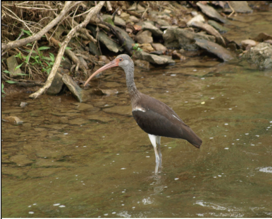
White Ibis, Taylor 28 August 2009