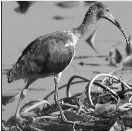
White Ibis, Rowan 21 November 2009 Rachel Jenkins

American Bittern – there were only three reports: 1 observed flying across KY 94 at Long Point 11 August (NM); 1 at Melco