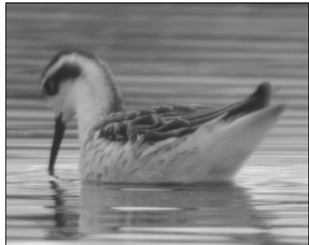
Red-necked Phalarope, Falls of the Ohio 21 September 2009

Wilson's Phalarope – 2 at Mitchell Lake 29 August (BY, MY, EH) were the only ones reported.