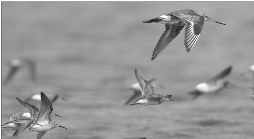
Hudsonian Godwit (with Stilt and Pectoral sandpipers), Ballard 17 September 2009

Least Sandpiper – season peak counts included at least 75 at Melco 31 August (EH); ca. 250 near Long Point 29 August (BY, MY, EH); at least 125 at Mitchell Lake 19 September (BP, EH, BY, MY); and ca. 110 at Eddy Creek 11 October (BY, MY). Two at Sauerheber 9 November (CCr); 5 at Melco 10 November (EH); 7 at the Dry Creek Unit 10 November (DR); and 13 at Casey Creek 22 Novem-