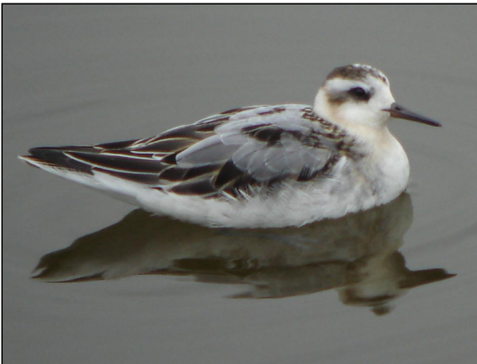
Red Phalarope, Jefferson 2 October 2009 Eddie Huber