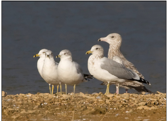
California Gull (w/ Ring-billed Gulls and Herring Gull) Barren River Lake State Resort Park 22 October 2009