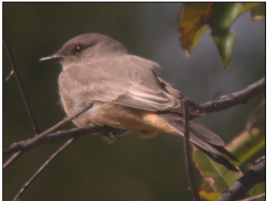
Say's Phoebe, Union 11 October 2009