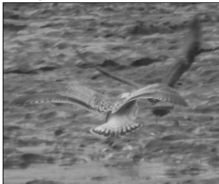
Great Black-backed Gull Falls of the Ohio, 25 November 2009 Eddie Huber

ber (BP et al.); and 15 at the Falls of the Ohio 25 September (AG). Two at Barren 17 October (DR et al.) were the latest to be reported.