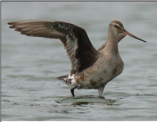
Hudsonian Godwit, Ballard 17 September 2009