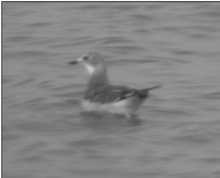
Sabine's Gull, Union 8 September 2009 Brainard Palmer-Ball, Jr.

Sabine's Gull – a juv. was at Camp #9 on 8 September (ph. BP). KBRC review required.