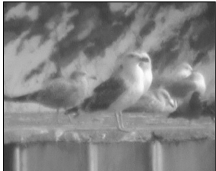
Great Black-backed Gull, Livingston 1 February 2010 David Roemer

Great Black-backed Gull – there were at least two reports: a first-year bird at Smithland Dam 14 January (†TD) with another or the same on Ky Lake above the dam 26 February (†BP, EH, HC); and a third-year bird at Ky Dam 1–4 February (vt. DR). KBRC review required