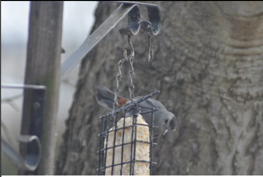
Gray Catbird, Jessamine 14 February 2010