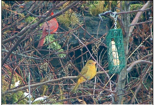
Summer Tanager, Frankfort 19 December 2009