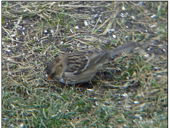
Harris's Sparrow, Oldham 29 January 2010