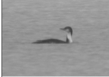
Pacific Loon, Kentucky Lake, Marshall 18 December 2009