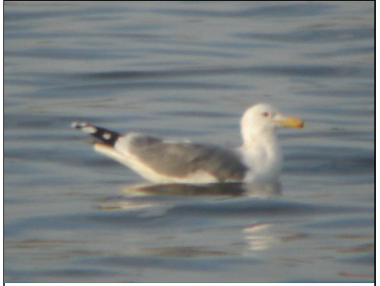
California Gull, Kentucky Dam 26 February 2010