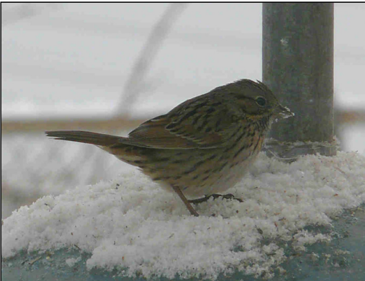
Lincoln's Sparrow, Jefferson 9 January 2010