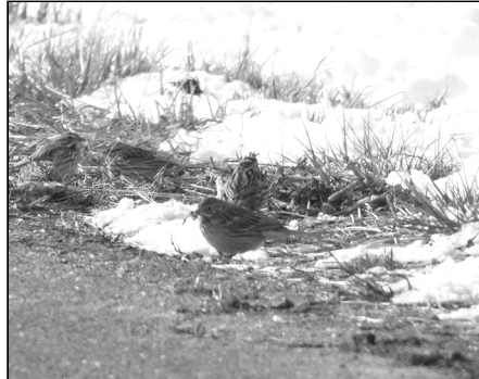
Vesper Sparrow, Livingston 1 February 2010