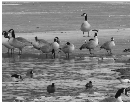
Cackling Geese (5), Madison 15 January 2010

Cackling Goose – there were several reports, all being included: 23 at Long Point 10 December (DR); 3 in Larue 2 January (DR); 1 on Barren 10 January (DR); 2 at the State Game Farm, Franklin , 11 January (BLi); small numbers at the Reformatory Lake 3 January (MSt)–mid-February with a peak count of at least 10 there during the first week of February (BP); 5 at Lake Reba, Madison , 15 January (AN); 2 at Griffin Park 19 January (DR); and 3 at Spindletop 14 February (DS).