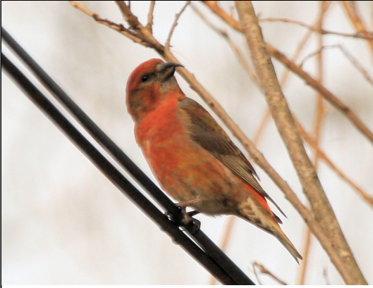
Red Crossbill (1 of 2), Calloway 24 February 2009 Terrence Little