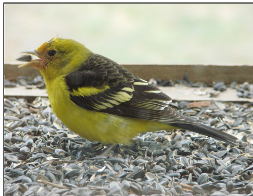
Western Tanager, Anderson 29 March 2013