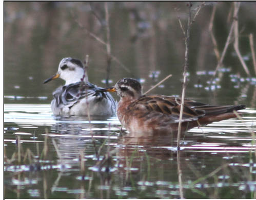
Red Phalaropes, Jefferson 8 May 2013