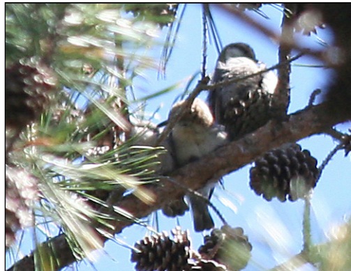
Brown-headed Nuthatches (3), Marshall 23 May 2013