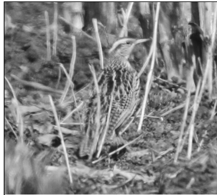
Western Meadowlark, Warren 21 March 2013 Brainard Palmer-Ball, Jr.

Western Meadowlark – there were reports from six locales: at least 3 se. of Needmore, Ballard , 8 March (vr. BP, EHu); 1 at McElroy Lake 21 March (ph. BP, EHu); 1 heard singing se. of Open Pond 27 March (BP); 4 e. of Lake No. 9 and 1 heard singing at Ky Bend, both 28 March (BP); and 3 males singing as if on territory between Hickman and Cayce, Fulton , 28 March (BP) with at least 2 still there 31 March (BP MSt), 1 still singing there 17 April (BP, EHu), and a pair with a female incubating 2/4 May (ph. BP, EHu/BY, MYa); unfortunately the nest was found destroyed by farming activities 19 May (BP, EHu).