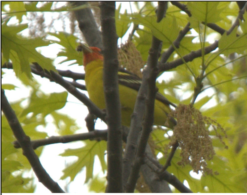
Western Tanager, Fayette 29 April 2013