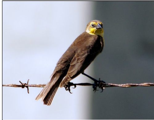
Yellow-headed Blackbird, Fulton 30 April 2013 Bobby Metz