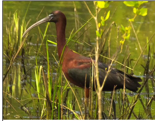
Glossy Ibis, Trigg 19 May 2013