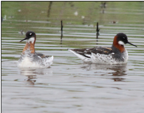
Red-necked Phalaropes, Jefferson 4 May 2013 Amy Lint