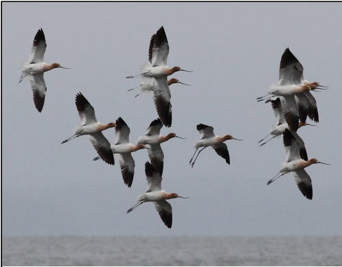
American Avocets (13), Marshall 10 May 2013