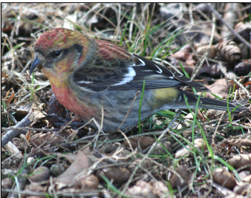
White-winged Crossbill, Campbell 14 March 2013 Frank Renfrow