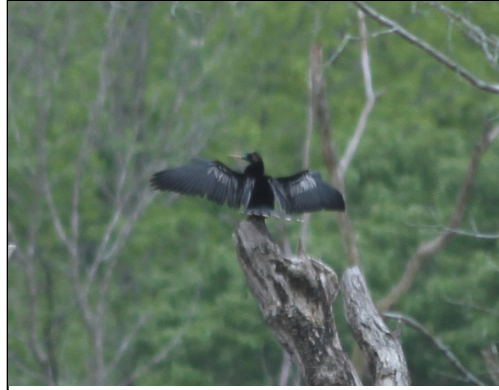
Anhinga, Muhlenberg 11 May 2013