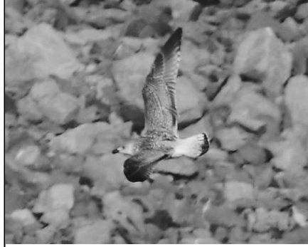
Great Black-backed Gull, Kentucky Dam 8 March 2013 Eddie Huber

(C&SRo); and 3 at Barren River Lake 25 May (JBy, MBy).