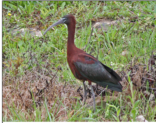
Glossy Ibis, Rowan 28 April 2013