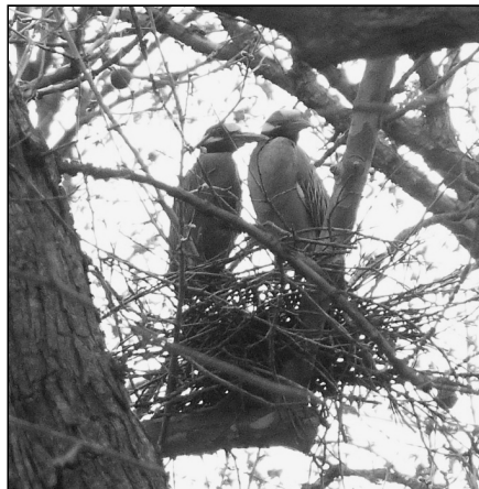
Yellow-crowned Night-Herons at nest Union , 10 April 2013 Charlie Crawford

Yellow-crowned Night-Heron – at least 6 active nests were located at the Highland Creek Unit, Sloughs WMA, Union , 10 April (ph. CC); also reported was 1 along Mayfield Creek upstream of KY 121, Carlisle , 10 May (JSo).