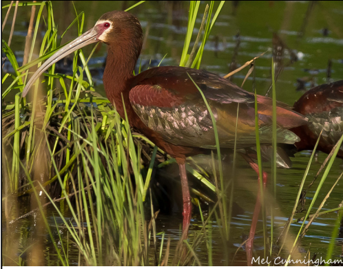
White-faced Ibis, Trigg 24 May 2013