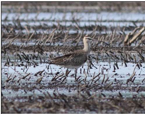
Whimbrel, Fulton 19 May 2013