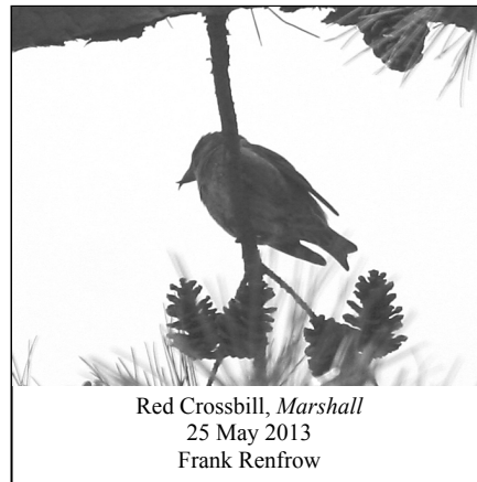
Red Crossbill, Marshall 25 May 2013 Frank Renfrow

Pine Siskin – relatively small numbers continued at a few locations from winter; small numbers of migrants (generally <10) appeared at a number of scattered locales during April and early May with lingering birds still relatively widespread during the second week of May and the latest lingering birds reported as follows: 2 in Boyd to 17 May (CT); 10-12 near Berry, Pendleton , 17 May (LH); 1 at Surrey Hills Farm 10/18 May (BP); 3 at Maysville, Mason , 18 May (FS); 2 at the LBL Nature Station to 21 May with 1 last heard there 25 May (JPo); 4 at the Ky Sheriff's Ranch 23 May (FR); 1 at Berea, Madison , 26 May (GBo, JPe); and 1 at Erlanger, Kenton , to 29 May (EG).