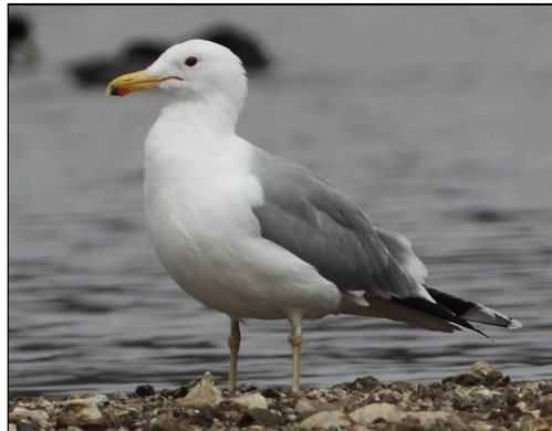
California Gull, Lyon 7 March 2013 Eddie Huber