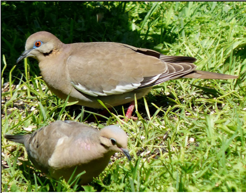
White-winged Dove, Henderson 12 May 2013