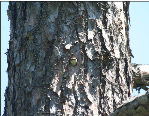
Brown-headed Nuthatch at nest hole, Marshall 21 April 2013 Frank Renfrow