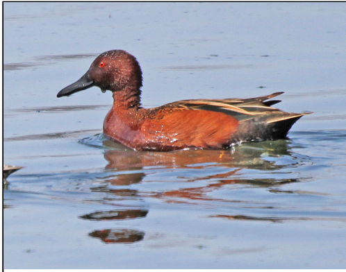
Cinnamon Teal, Fayette 29 March 2013