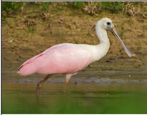
Roseate Spoonbill, Trigg Co. 4 August 2014