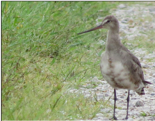
Hudsonian Godwit, Rowan Co. 11 September 2014