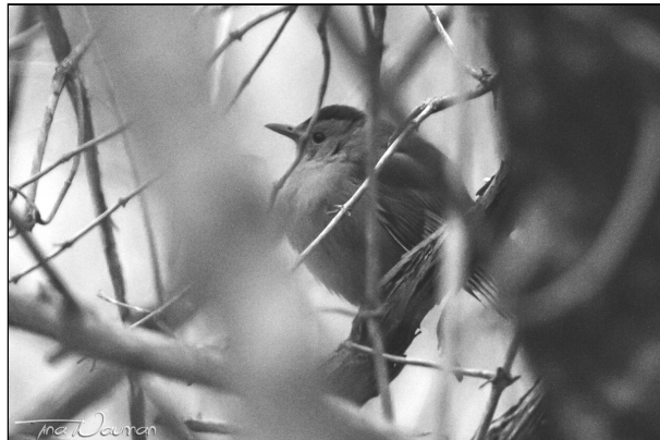
Gray Catbird, Lexington CBC 20 December 2014