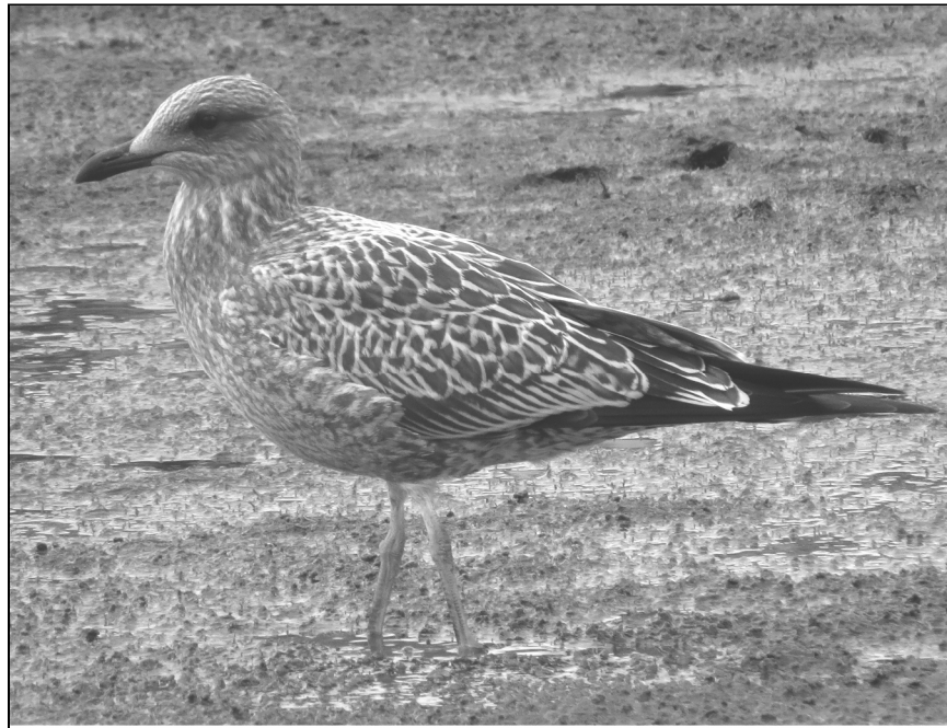
Lesser Black-backed Gull (juv.), Rowan Co. 13 September 2014 Brian Wulker

WMA, Ballard , 13 November (GBu) and 1 at Sinclair 28/30 November (P&SF/TG, SG).