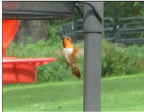
Rufous Hummingbird, Muhlenberg Co. 12 August 2013