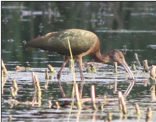
Plegadis ibis, Union Co. 24 October 2014