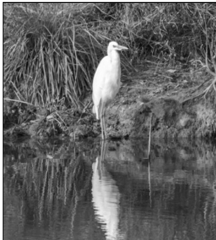
Great Blue Heron (white morph) Trigg Co., 14 November 2014

Great Blue Heron – a bird that appeared to be a white morph was photographed at the Long Creek Refuge, LBL, Trigg, 14 November.