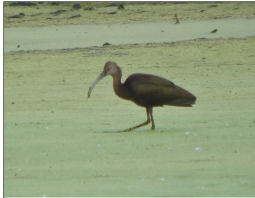
Plegadis ibis (1 of 3), Union Co. 16 September 2014 Eddie Huber