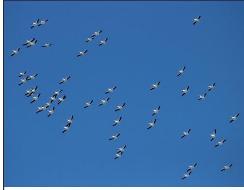
American White Pelicans (51) Falls of the Ohio, 21 September 2014