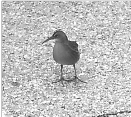
Virginia Rail, Rowan Co. 7 Nov 2014 Brian Wulker

American Avocet – there were four reports: 1 at Camp #11 on 24 August (ph. BP, ph. EH); 1 over the Ohio River at Cox's Park, Louisville, 26 August (RL); 2 at Camp #9 on 16 September (ph. EH, BP); and 3 on the Ohio River at Louisville and later at the Falls of the Ohio 5 November (ph. EH et al.).