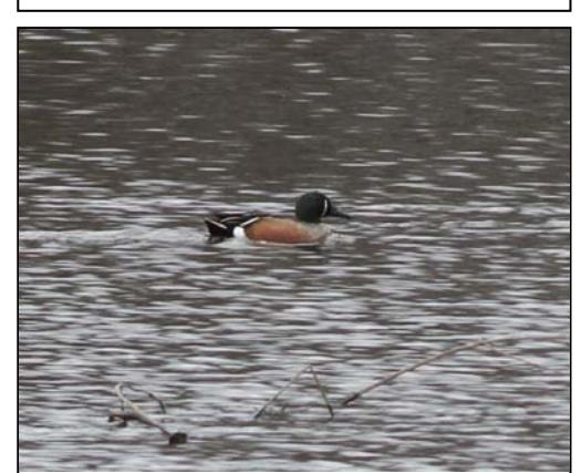
Northern Shoveler x Blue-winged Teal, Jefferson Co. 27 March 2015