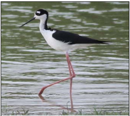
Black-necked Stilt, Jefferson 27 May 2015 Diana Dubbeld

Black-necked Stilt - 1 at Mud Creek and 2 in the Lower Hickman Bottoms 10 April (BY) were the earliest to be reported; up to 19 (8 May [TG, SG]) were present in the Lower Hickman Bottoms during May (m. ob.). Reports away from the Mississippi River floodplain included 1 nw. of Newtown, Scott, 16 April (ph. MH); 2 at Parsons Pond 3 May (ph. FL); 2 at McElroy Lake 3 May (TD) with 4 there 5 May (LCr, TD, et al.) and up to 8 (18 May [TD]) present there during the month with at least 1 pair incubating [but eventually unsuccessful] there during late May (TD) and 3 last seen there 31 May (TD); 2 at Sauerheber 4-11 May (KMi, CP); 2 s. of Middleton 4-19 May (ph. RD, TG, SG, et al.); 1 at Jacobson Park 5 May (ph. LCo, DSv, et al.); 2 at Sandy Watkins Park 5 May (ph. CC); and 1 at Louisville Trackside off Preston Highway 27-28 May (ph. DD et al.) that was a long overdue first for Jefferson.