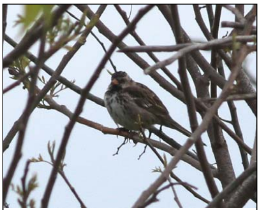
Harris's Sparrow (ad.), Muhlenberg Co. 30 April 2015