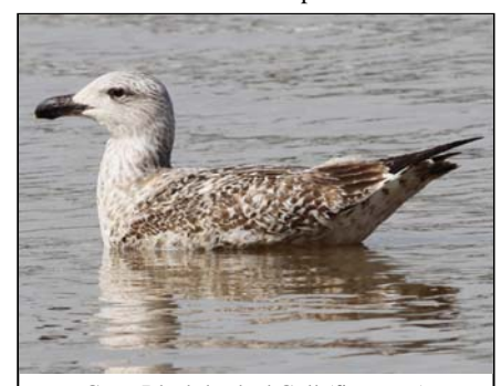
Great Black-backed Gull (first-year) Ohio River at Louisville, 8 March 2015 Brainard Palmer-Ball, Jr.

Yellow-billed Cuckoo - singles at Blackacre SNP, Jefferson, 24 April (TBa) and at Mammoth Cave 25 April (CW, BPa) were the earliest to be reported.