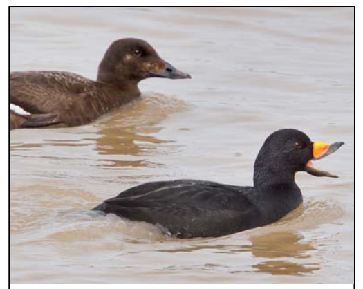
Black Scoter (ad. male w/ White-winged Scoter) Jefferson Co., 12 March 2015 Pam Spaulding