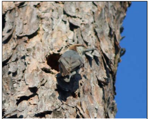
Brown-headed Nuthatch (w/ food at nest cavity) Marshall Co., 5 May 2015 Frank Renfrow