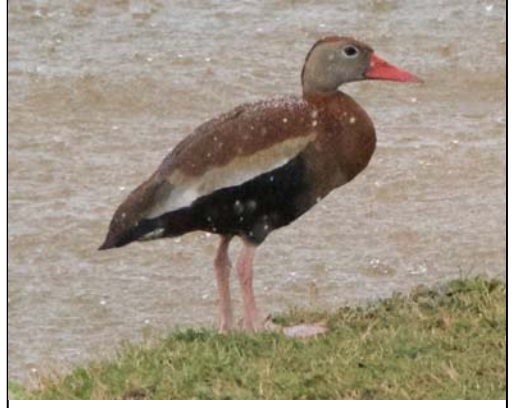
Black-bellied Whistling-Duck, Madison Co. 19 April 2015