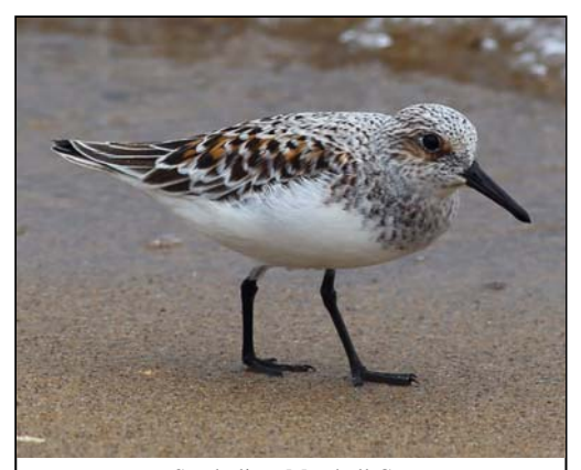
Sanderling, Marshall Co. 10 May 2015