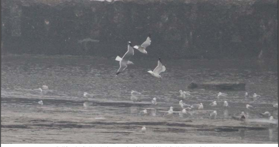
California Gull (ad.) in pursuit of Ring-billed Gull, Falls of the Ohio 1 March 2015

As a participating member of the CFL, the Society has been registered as a qualifying recipient for donations that will be solicited through a one-day, internet giving campaign called "Give Local Louisville" that will occur on October 1, 2015. Visit the Give Local Louisville web site at (http://www.cflouisville.org/grants-partnerships/give-local-louisville/) or the CFL web site at (http://www.cflouisville.org/) to learn more about this exciting opportunity to donate to the Society as well as a wealth of background information on CFL.