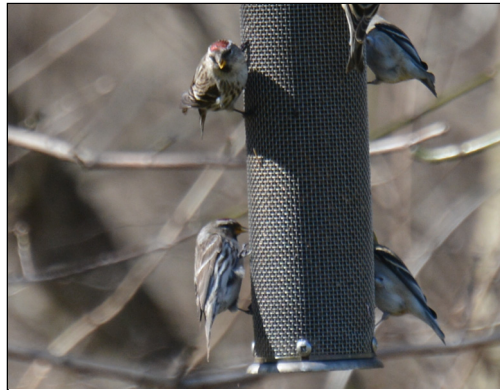
Common Redpolls, Kenton Co. 28 February 2016