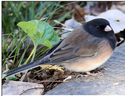
Dark-eyed "Oregon" Junco, Jefferson 15 November 2015 Ben Yandell

Rose-breasted Grosbeak – an imm. male was at a feeding station in Lexington 12-13 December (ph. AH, CV).