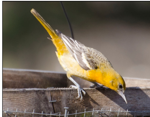
Baltimore Oriole, Oldham Co. 6 February 2016