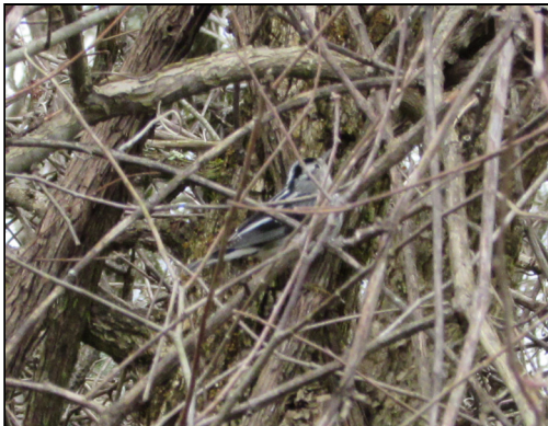
Black-and-white Warbler, Fayette Co. 9 January 2016 Anna Wiker