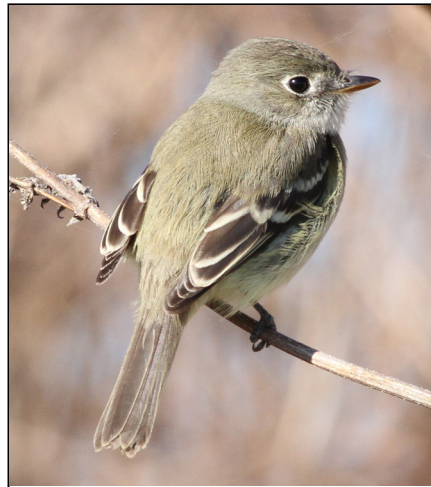
Least Flycatcher, Fulton 19 December 2015 Brainard Palmer-Ball, Jr.

Least Flycatcher – 1 was seen and heard calling (whit notes) at Lake No. 9 on 19 December (ph. BP, ph. EH, DW, MG, RS, VS). Under KBRC review.