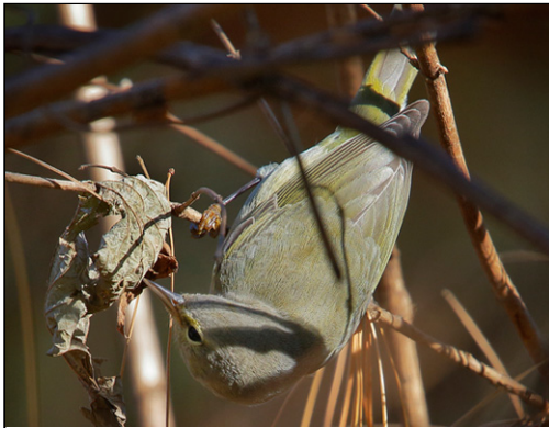
Orange-crowned Warbler, Jefferson Co. 8 December 2015 Pam K. Spaulding