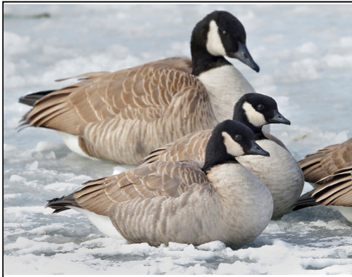
Cackling Geese, Franklin Co. 21 January 2016 Pam K. Spaulding