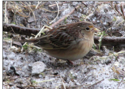
Grasshopper Sparrow, Logan 14 February 2016 Frank Lyne

Fox Sparrow – the species was not present in exceptional numbers this winter with 1-43 reported on 17 CBCs.