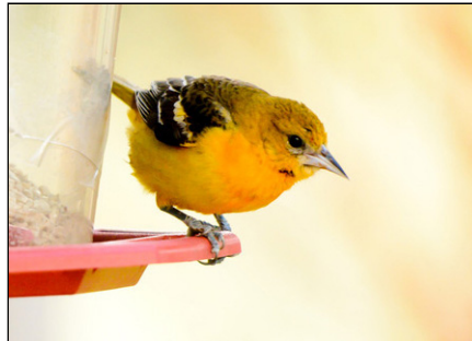
Baltimore Oriole, Calloway 1 January 2016 Kathy & John Mitchell

Pine Siskin – generally modest numbers lingered locally into early winter with 2-55 reported on only four CBCs; generally low numbers remained quite locally distributed through the remainder of the winter. Peak tallies included at least 55 along Kelly Branch Road, Ballard , 22 December (BP, EHu, GL); 40 at Evergreen Cemetery, Campbell , 13 December (FR) with 50+ there 6 January (FR); 50 at Wood Creek Lake, Laurel , 27 December (AK); and 150+ along Swift Camp Creek, Wolfe , 20 February (BWu).