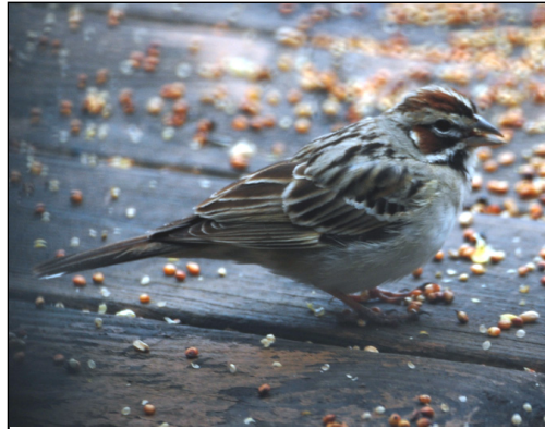
Lark Sparrow, Scott Co. 17 February 2016