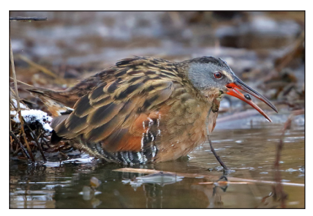
Virginia Rail – Jefferson , 5 December 2018, Pam Spaulding

Jefferson , 5 December (ph PS, JB, ph PB). 1 in marsh along CR-1005, near Drakesboro, Muhlenberg , 30 December (ph TQ, BPB). 2 heard at Adkins Swamp, Peabody WMA, Muhlenberg , 6 January (TG, SG).