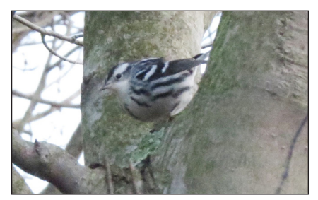
Black-and-White Warbler – Jefferson, 16 December 2018, Michael Callan

Common Yellowthroat – 1 at Long Point, 15 December (ph CBz, BPB). 1 at the Sauerheber Unit, 6 January (wr ph TQ, RbC).