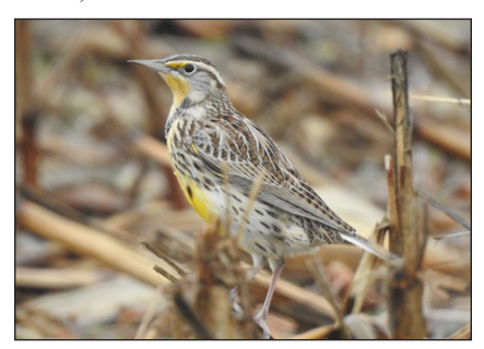
Western Meadowlark – Fulton, 15 December 2018

Common Yellowthroat – 1 at Long Point, 15 December (ph CBz, BPB). 1 at the Sauerheber Unit, 6 January (wr ph TQ, RbC).