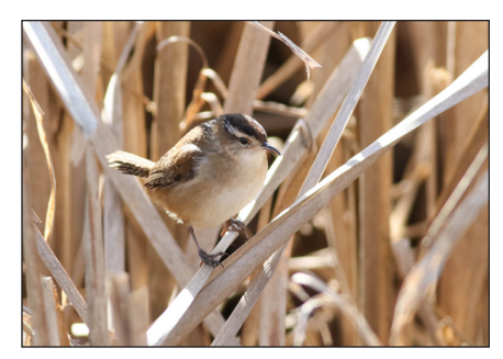
Marsh Wren – Henderson, 6 January 2019