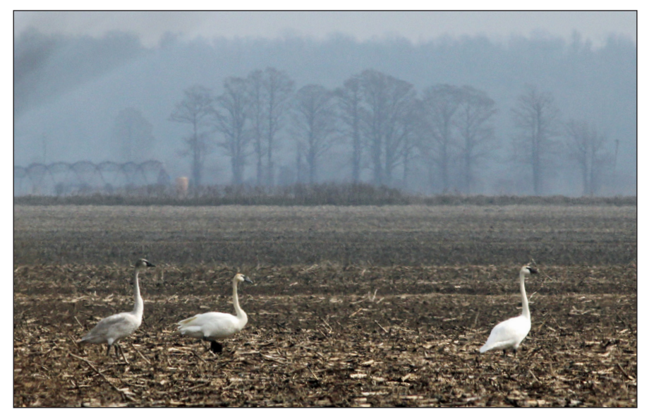
Trumpeter Swan - Fulton, 1 February 2019