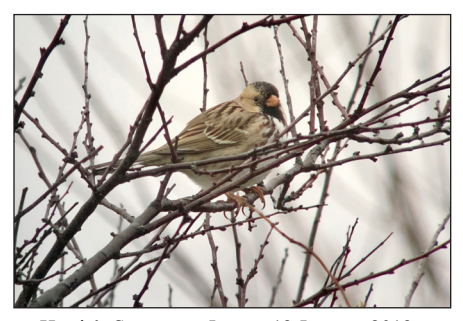
Harris's Sparrow – Logan, 13 January 2019