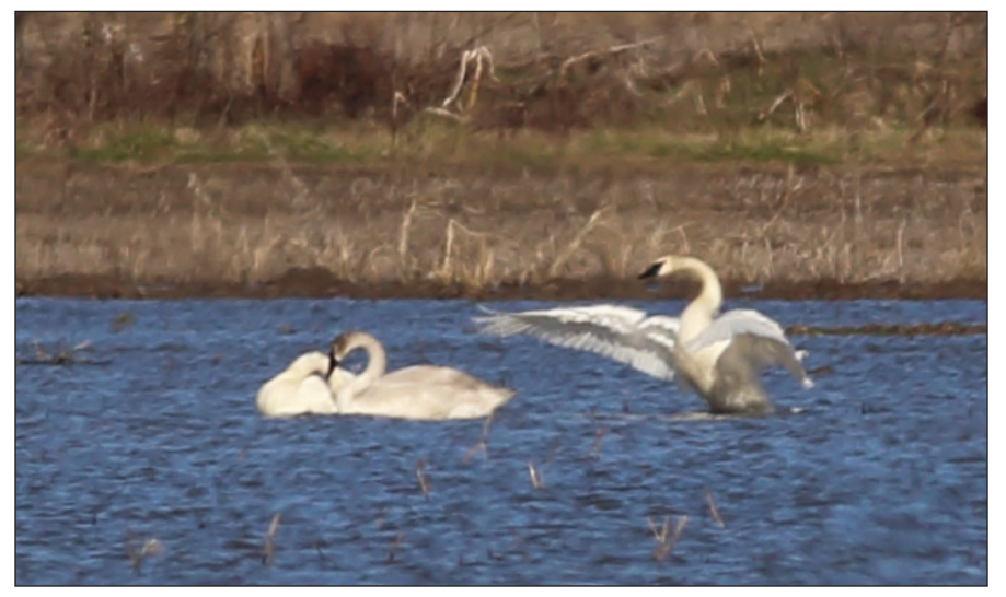
Trumpeter Swan - Fulton, 9 January 2019, Ben Yandell