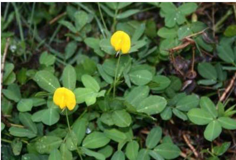
Figure 3.5: Arachis hypogaea (Peanut)

Although we think of it as little more than a food source today, the common peanut, Arachis hypogaea , (Figure 3.5) was a widely used herb in Aztec culture. The leaf, the seed (nut) portion of the plant, and the oil were useful, and could relieve a