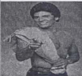
Erik Estrada says: