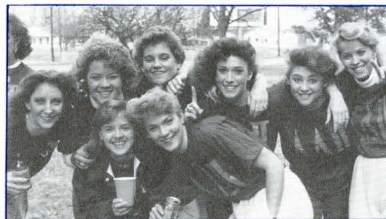
Epsilon Delta's huddle while cheering ADPi to a Sigma Chi Derby victory for the third year in a row. We raised $700 for the Louisville, Ky., Ronald McDonald House, our national philanthropy.