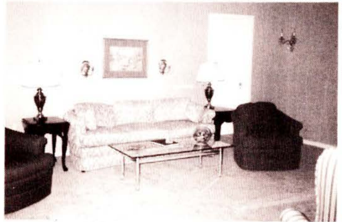
1600 Chestnut's new living room.

Thanks to several Alumnae, 1600 Chestnut is looking better than ever. The living room has had the most work done with new carpet, paint, drapes, and furniture. Another drastic change is the new TV room. A wall was knocked out and a bedroom converted in order to provide more recreational space for the chapter. Other improvements include: new wall paper, paint and flooring in the upstairs and downstairs halls, and new wallpaper in all the bathrooms and kitchen. Not only the inside, but the outside of the house has had several improvements with new paint on the trim and new landscaping.