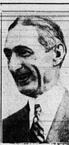
Hon. William Gibbs McAdoo