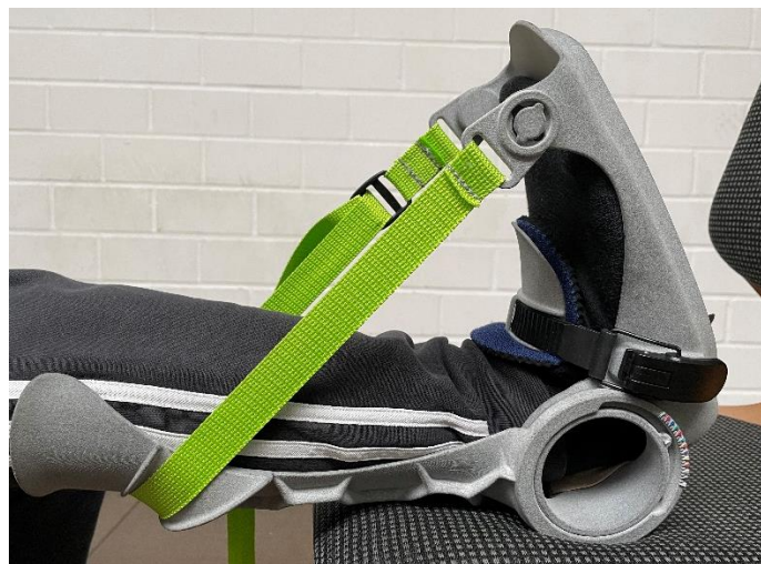
Figure 2. Orthosis for stretching the calf muscles with included goniometer to determine the range of motion in the ankle joint with extended knee joint.

As a second test to determine the effects of the stretching training on ROM, ORTH was used. While sitting on a chair, participants had to place their foot on an object of same height as the hip. From the starting position (neutral 0 position), the investigator pushed the foot carefully into maximal dorsiflexion. The angle, which was reached by pressing the foot of the participant in the maximally dorsiflexed position determined as either the participant's maximal tolerable pain or the inability to further increase the angle, in the upper ankle joint was measured via the goniometer on the orthosis. Each big indentation of the goniometer corresponds to an increase of 5°, and each little indentation corresponds to an increase of 2.5°. While performing a stretch with extended knee joint, the achieved angle was read off. This procedure was also performed in previous studies with high reliability (ICC = 0.990-0.997) (41).