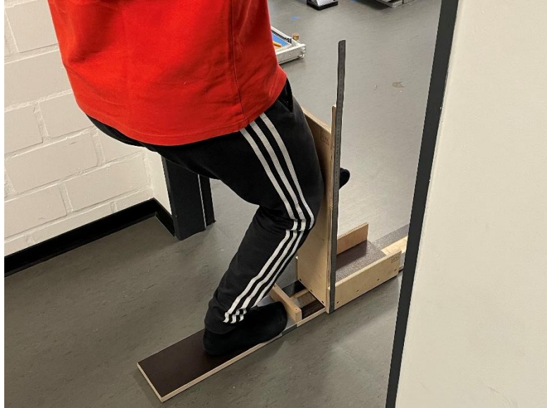
Figure 1. Sliding device for the knee to wall test to evaluate flexibility in the ankle joint with bended knee joint.

As a second test to determine the effects of the stretching training on ROM, ORTH was used. While sitting on a chair, participants had to place their foot on an object of same height as the hip. From the starting position (neutral 0 position), the investigator pushed the foot carefully into maximal dorsiflexion. The angle, which was reached by pressing the foot of the participant in the maximally dorsiflexed position determined as either the participant's maximal tolerable pain or the inability to further increase the angle, in the upper ankle joint was measured via the goniometer on the orthosis. Each big indentation of the goniometer corresponds to an increase of 5°, and each little indentation corresponds to an increase of 2.5°. While performing a stretch with extended knee joint, the achieved angle was read off. This procedure was also performed in previous studies with high reliability (ICC = 0.990-0.997) (41).