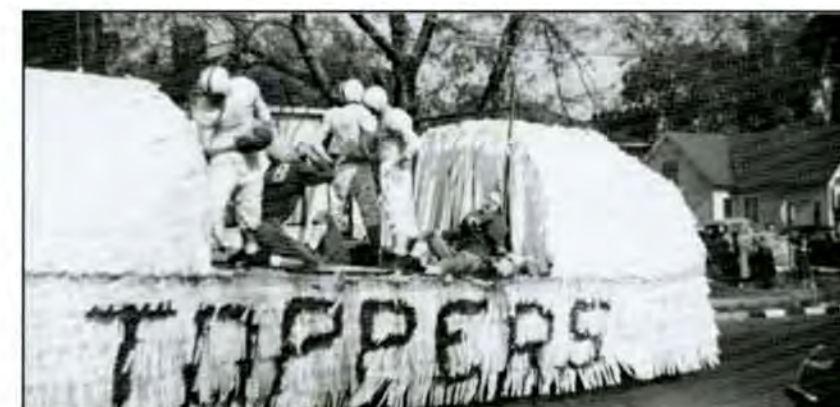
Potter Hall float, '51