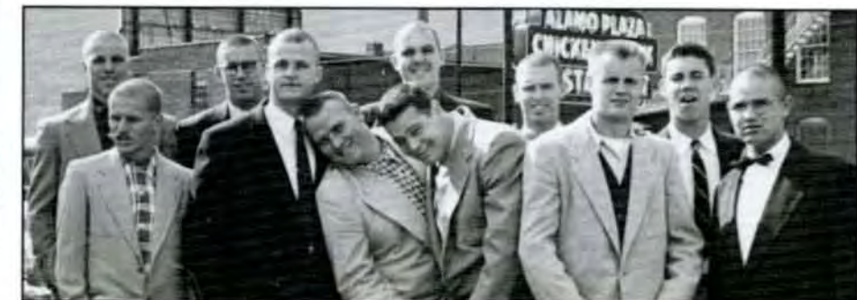
Western frosh, '53, in Chattanooga after initiation.