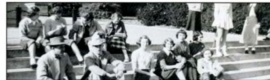
Waiting—a part of college life in the 50s.