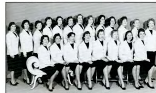
Beta Omega Chi, '59