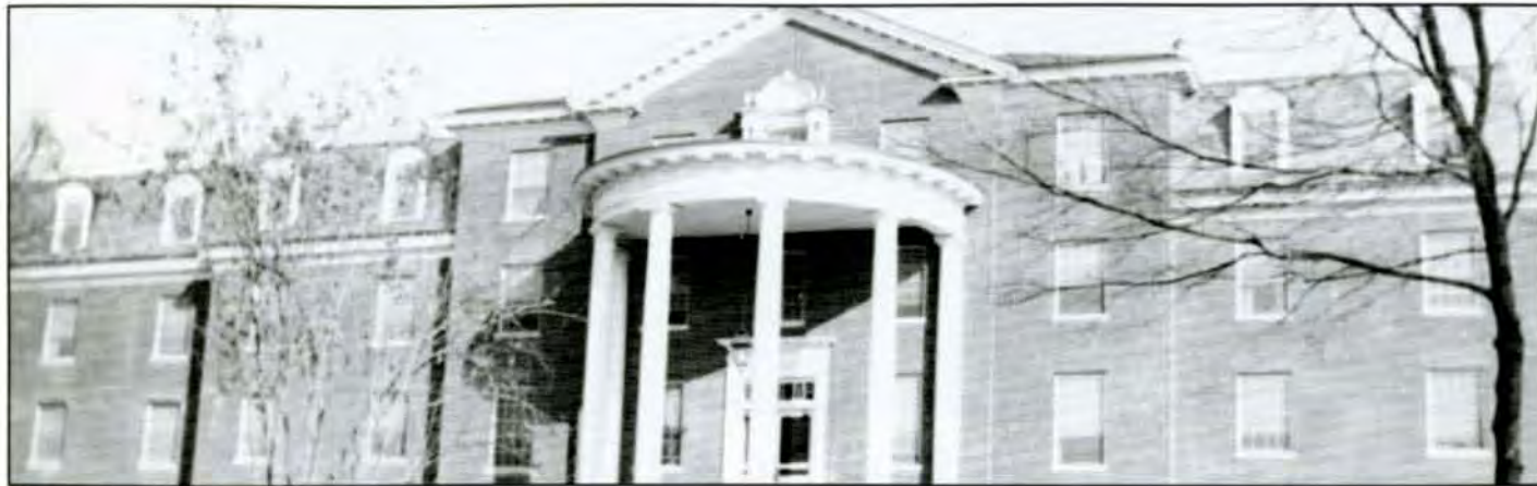
McLean Hall, the new girls' dorm.