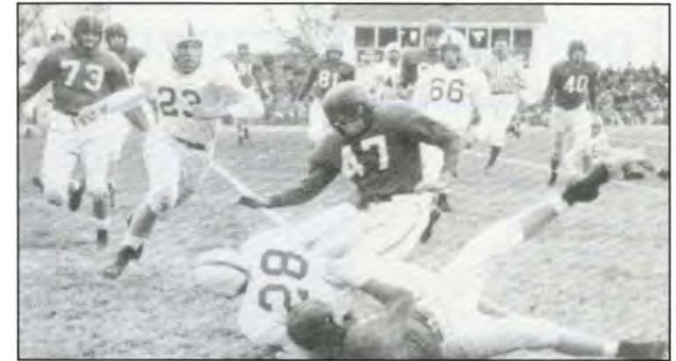
A tackle in '51

Western 12, SE Missouri 0 East Tennessee 8, Western 0 Middle Tennessee 10, Western 7 Youngstown 20, Western 6 Tennessee Tech 7, Western 3