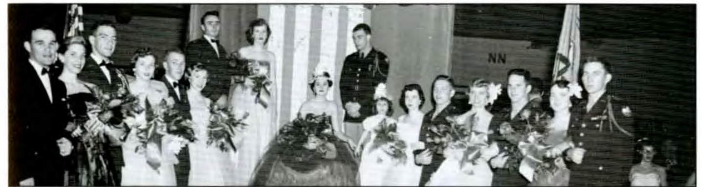
The queen and her court