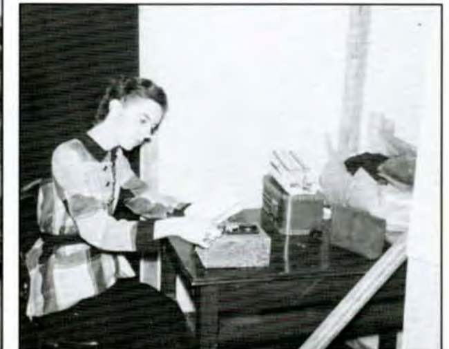
Behind the scenes, the prompter