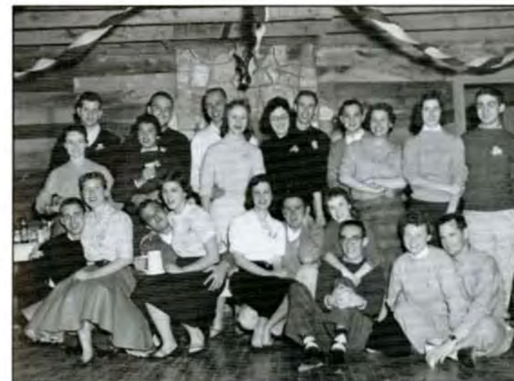
Sigma Phi Alpha party, '58