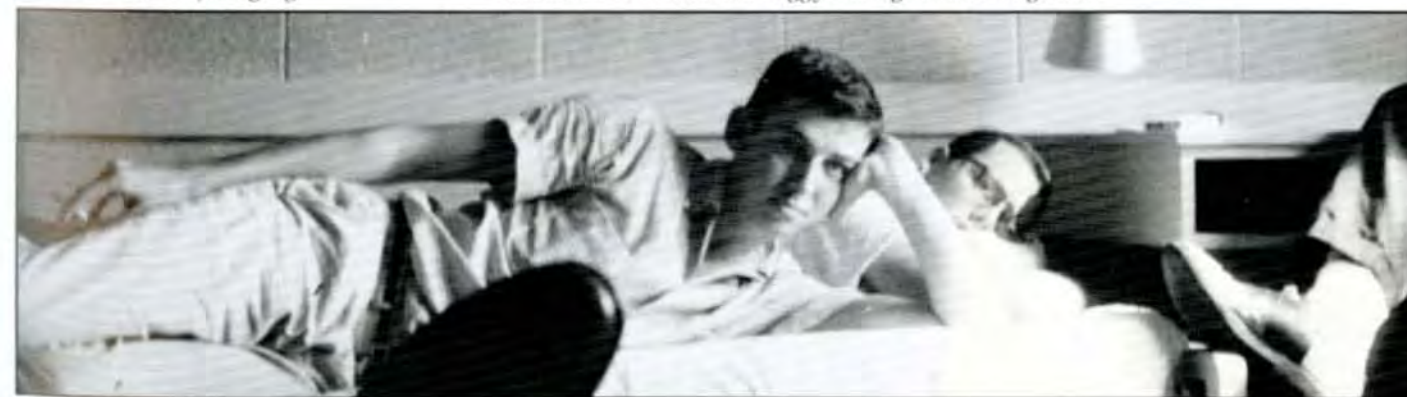
Relaxing, a key to survival in the 50's