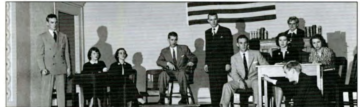
"The Night of Jan. 16"