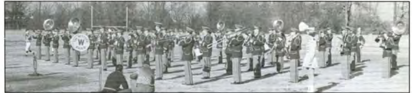
The band entertained during football games