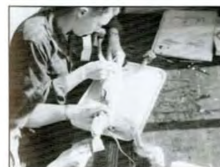
Cutting up cats