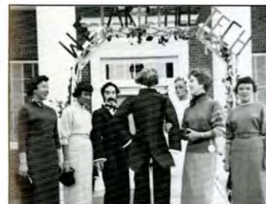
"We Take Thee Tech"