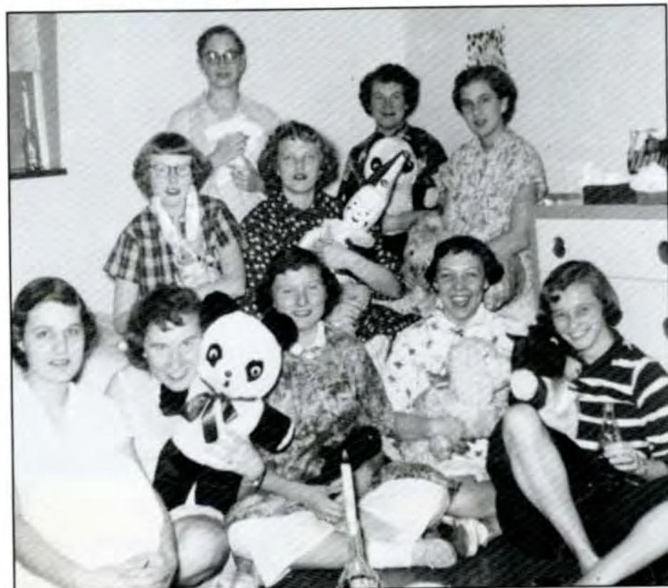
Christmas Party, Third Floor, McLean Hall, '53

Sometimes we studied, sometimes we played, but we always had good times in those dorms.