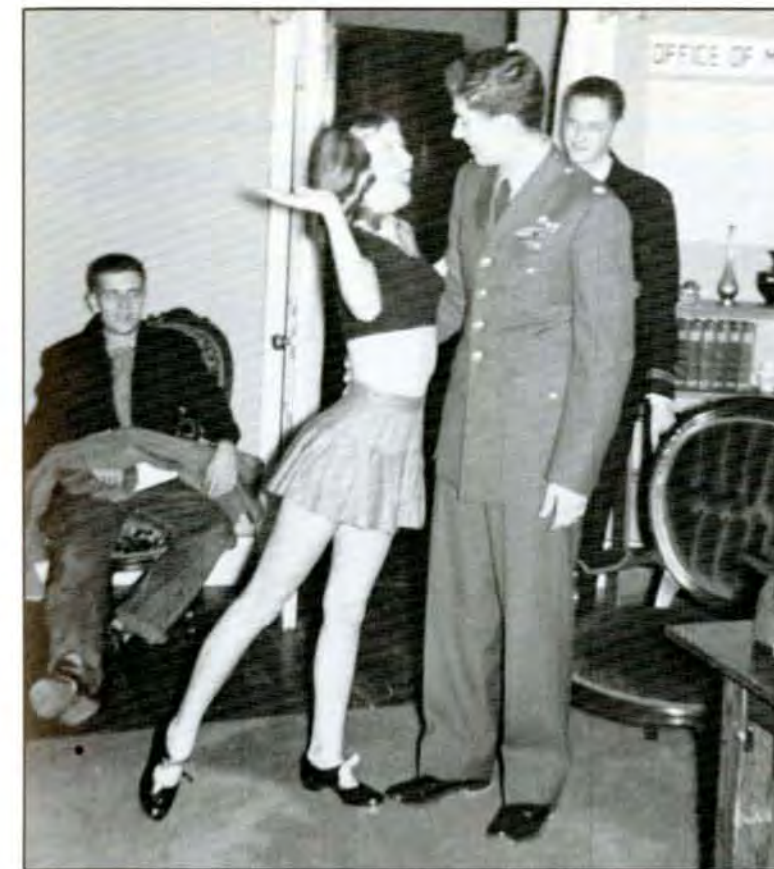
"Two Blind Mice," '51