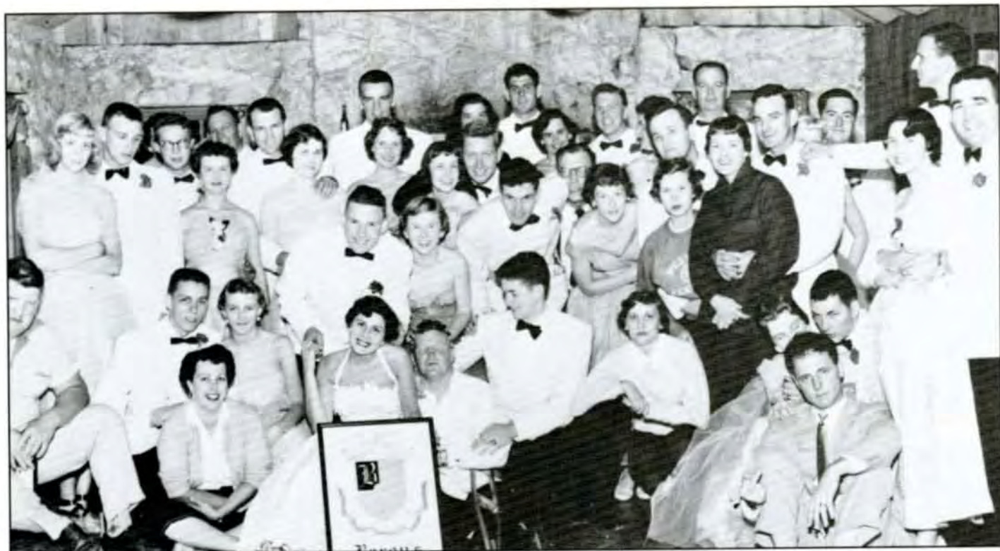
After the formal in 1954