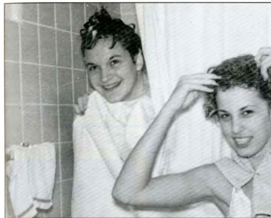
Privacy? Not in the dorm!