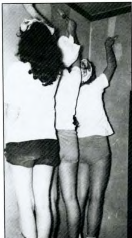
Renovating Potter Hall