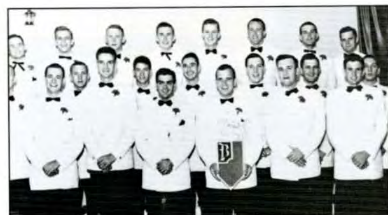
Baron's Club, '52