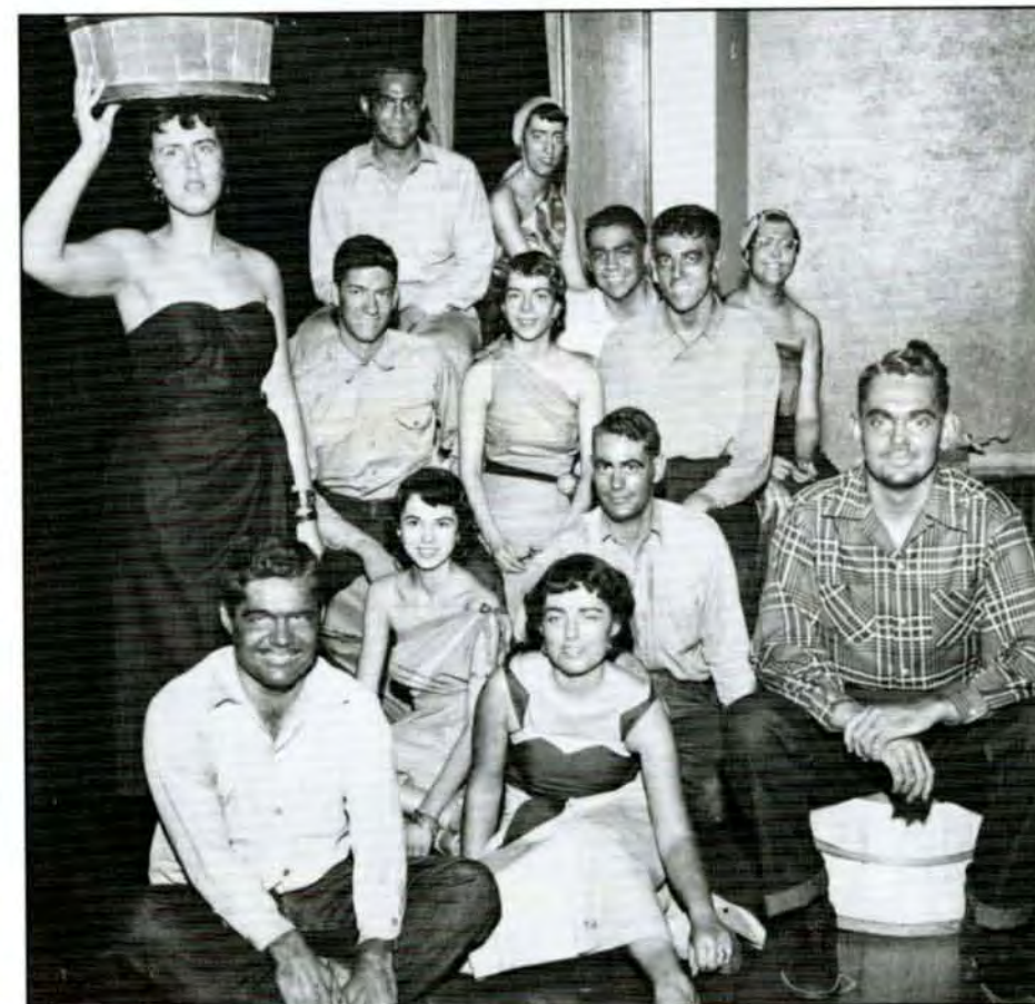
"Lost in the Stars"