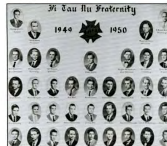
Pi Tau Nu