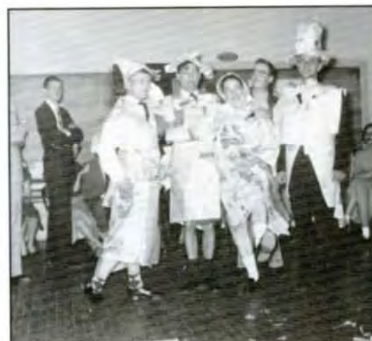
Music Department Christmas party