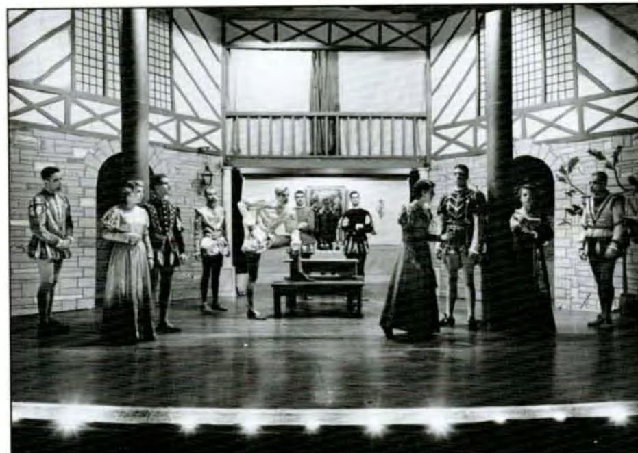
"The Taming of the Shrew"

The Western Players and audiences alike escaped into many worlds as the theatre troupe performed dozens of plays in the Fabulous 50's.