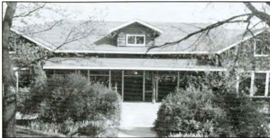
The Cedar House, used for recreation in the 50's.