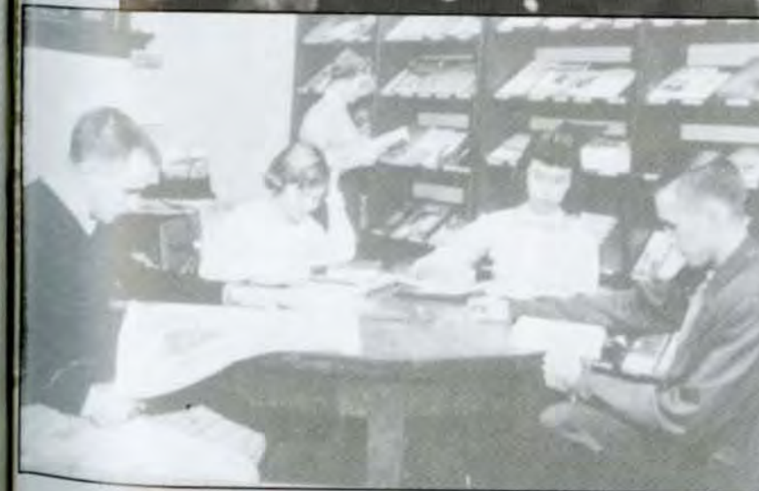
The fun of the 50's may be best recalled now, but the work and the learning have carried the Western alumni far.