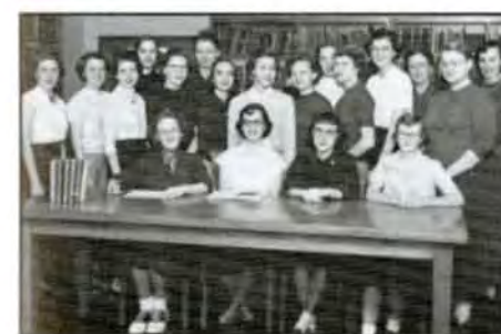
Ragland Library Club, '52-'53