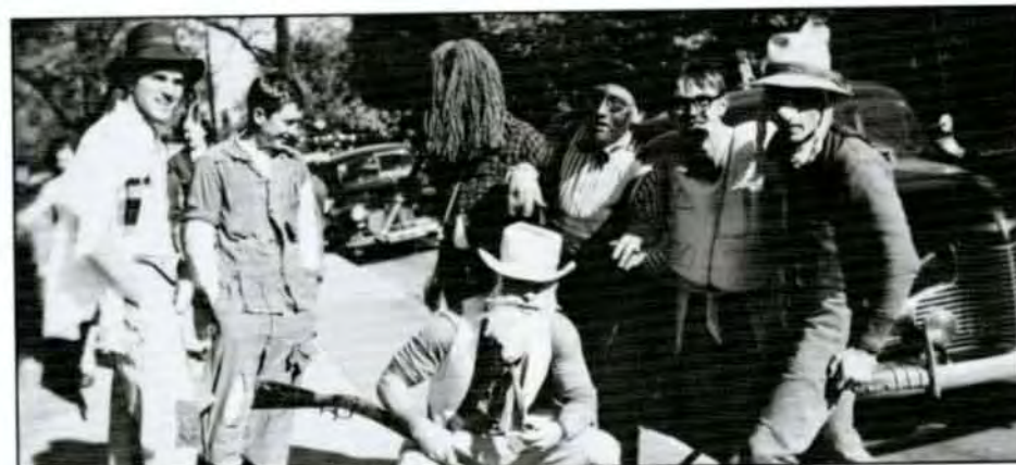
What a crew!