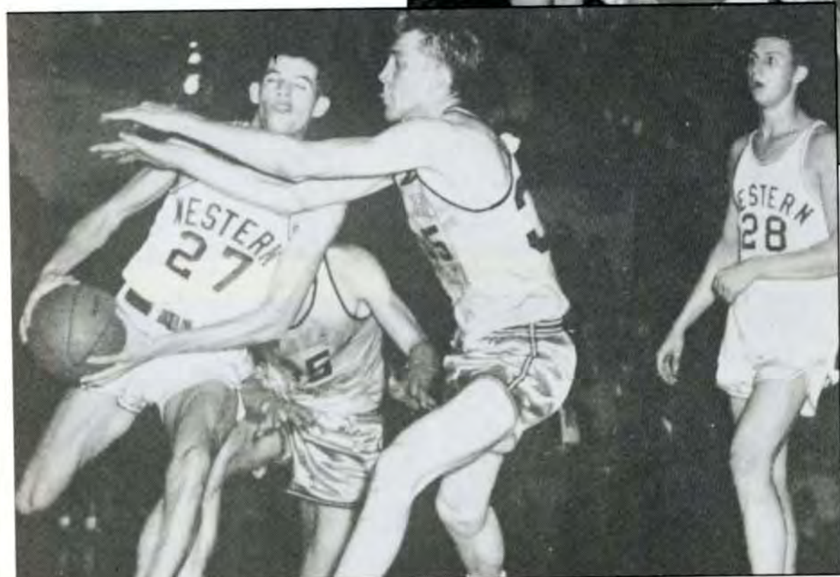
Hard play shows on the faces