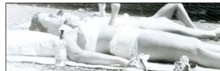
Sunbathing on the roof of West Hall, '53