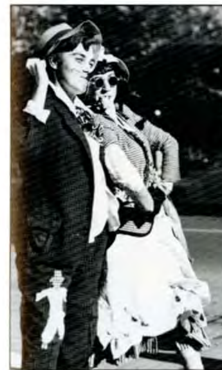
An odd couple!