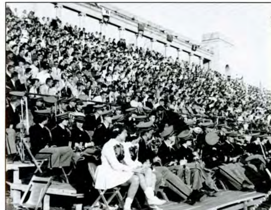
A packed stadium in '53