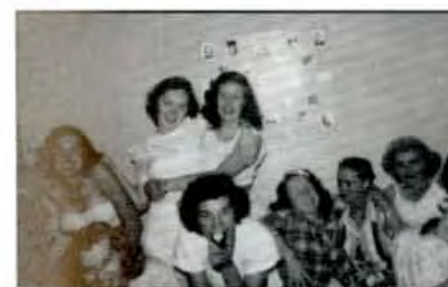
Potter Hall second floor gang