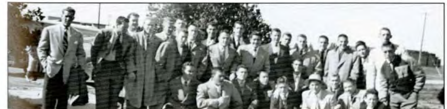
'57 football team before leaving Florida