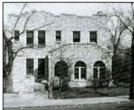
The Rock House