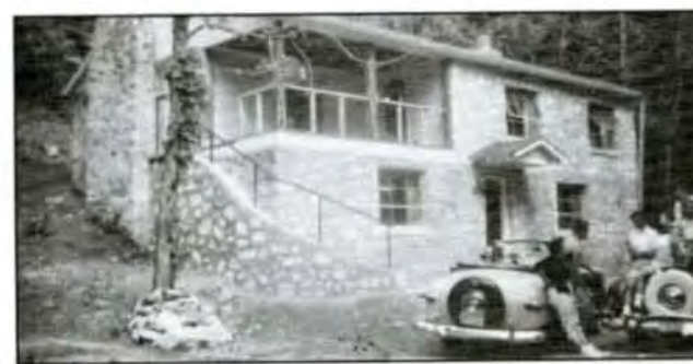
Baron's Camp, '56