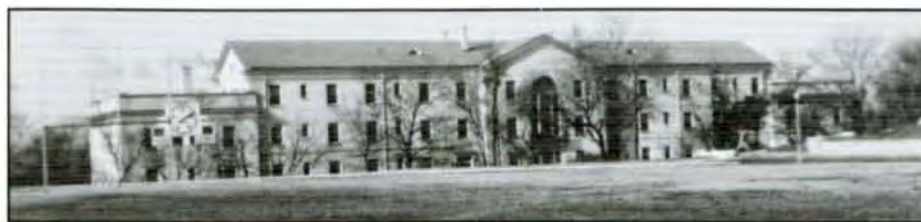
The Gymnasium in the early 50's.