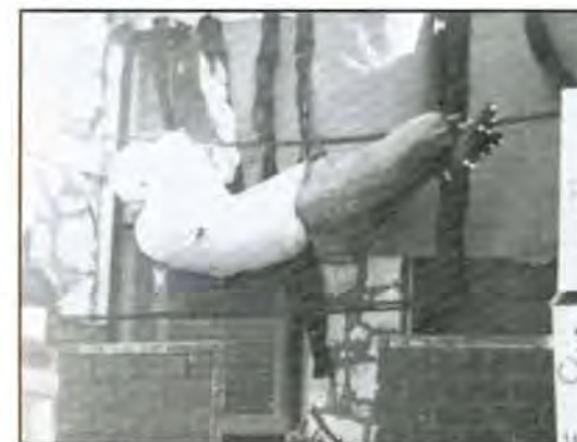
Rock House decorations, '53