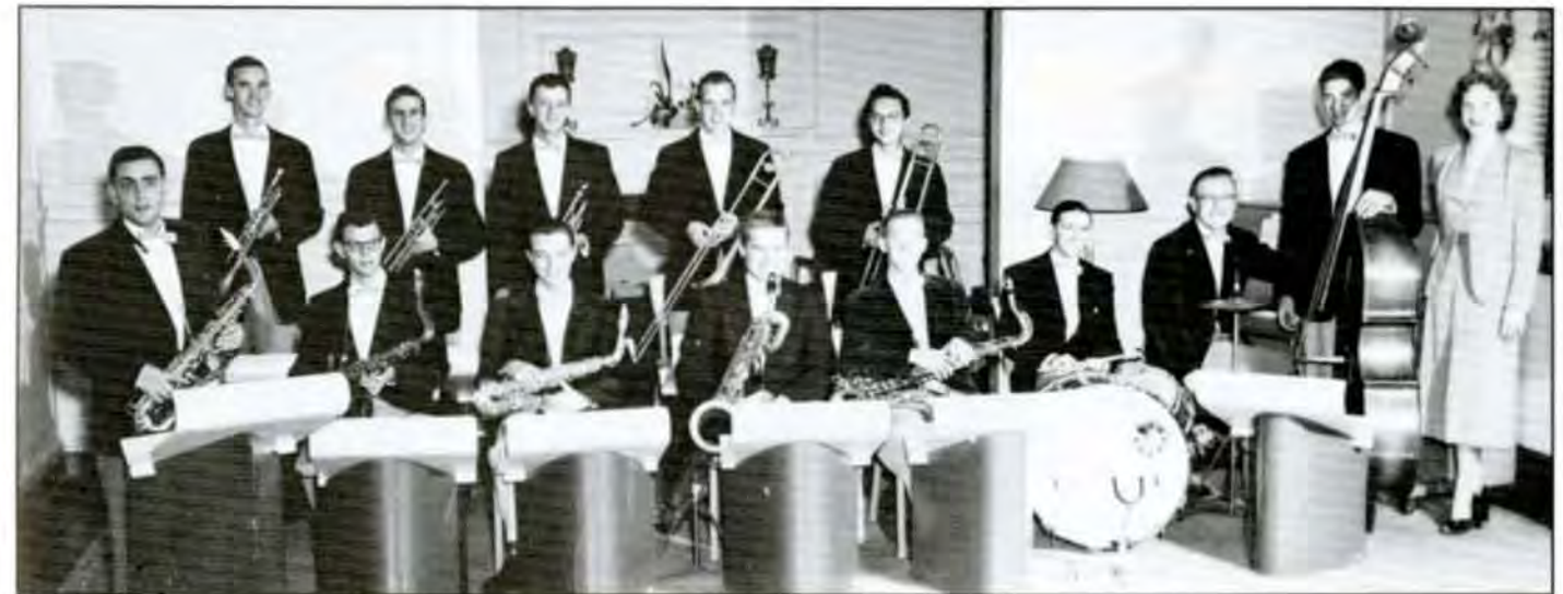
The Red and Gray Orchestra, '53

From the sock hops to the orchestra pit, music played a major role in college life in the Fabulous 50's.