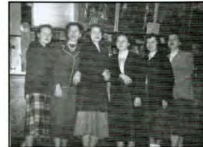
The Goal Post was a favorite hangout after classes for sodas, music and lots of talking.