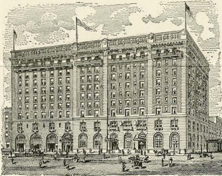
Seelbach Hotel, Where the Western Normal and Teachers College will have its headquarters.

We earnestly hope that every former student will tell other students about the get-together meeting and urge them to be present. The forthcoming meeting is going to be, without