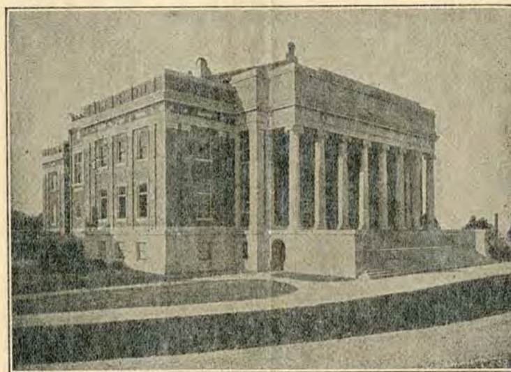
Vanmeter Hall and Administration Building, Western Kentucky State Normal School.

If you are not in a position to enter school here next term, write and let us help you through our Department of Correspondence and Extension.