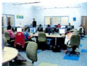
Preston Student Success Center Computer Lab

Well equipped with staff, the Preston Student Success Center Computer Lab employs eight student workers, 2 of whom are on duty during all hours of operation. The myriad benefits of a full staff are undeniable. The lab is always equipped with supplies, and the workers ensure that each computer is operating properly. Students with questions about various software applications are able to receive assistance when time allows. Most importantly, constant supervision allows for quieter study-friendly environment. One student commented, "There aren't cell phones ringing constantly."