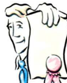
Congratulations Liberal Arts and Sciences Division

at the community college for displays that will continue to encourage student engagement and familiarize them with LAS faculty, policies and opportunities.