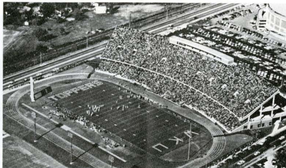
19,250-Seat L. T. Smith Stadium and Its Quarter-Mile, All Weather Track