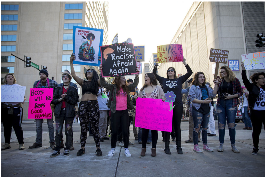
Women's March participants stand in front of counter-protestors chanting "No Hate. No Fear. Everyone is welcome here" on Saturday, Jan. 20 in downtown Nashville.