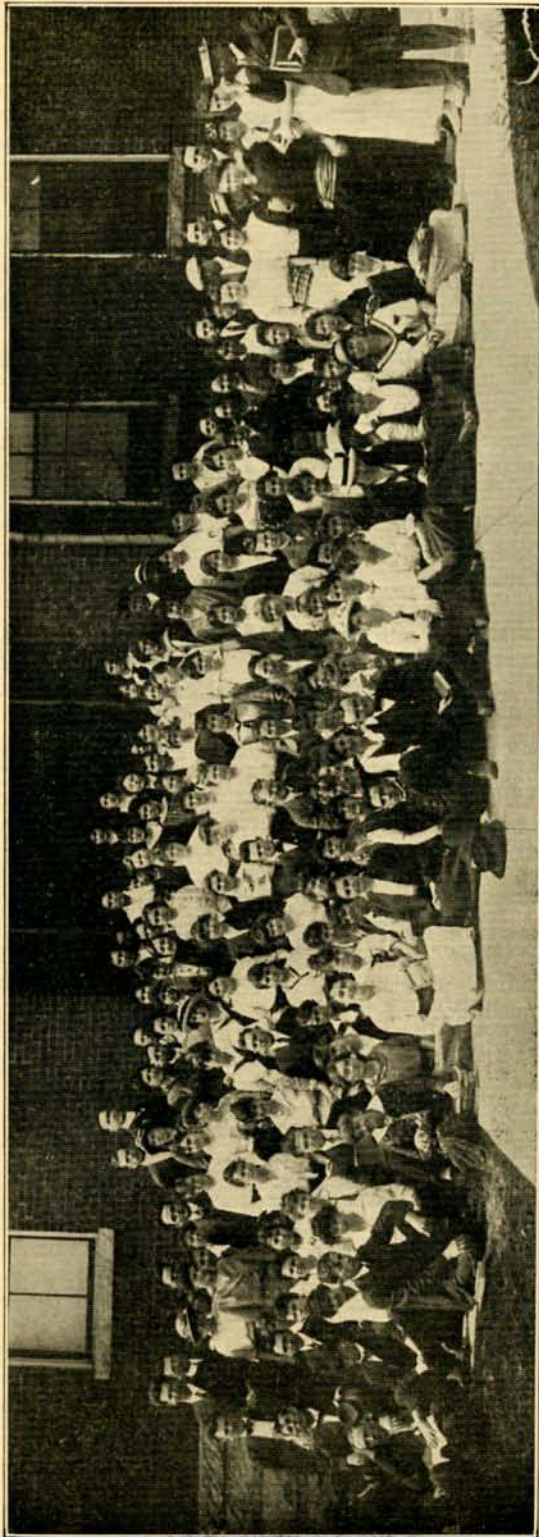
A GROUP OF HIGH SCHOOL GRADUATES IN ATTENDANCE AT THE WESTERN KENTUCKY STATE NORMAL SCHOOL

Within the last year there have been in attendance at the Normal School 208 four-year High School graduates, 56 three-year High School graduates and 88 two-year High School graduates