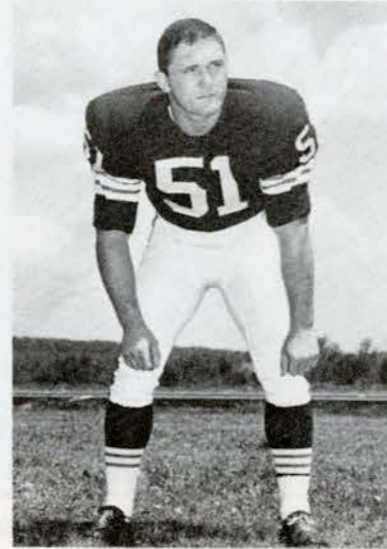
1964 College Division All-American Currently Cleveland Browns Linebacker