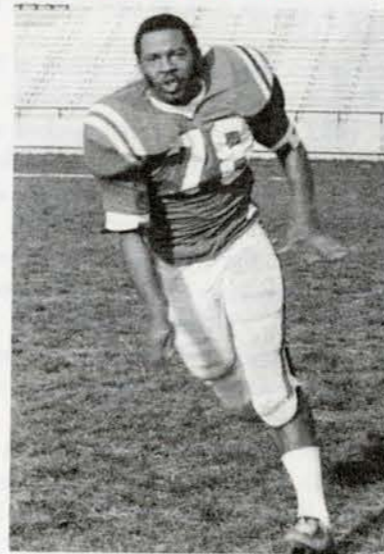
1969-1970 OVC Defensive Player of the Year 1970 College Division All-American Drafted by St. Louis Cardinals