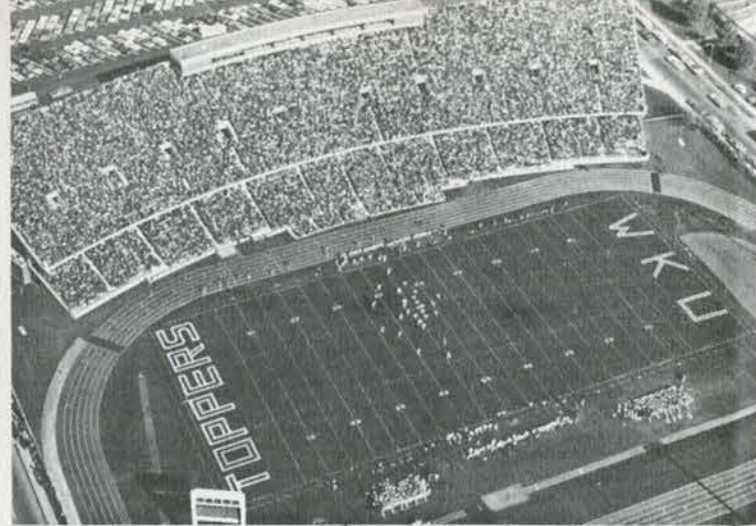
19,250-Seat L. T. Smith Stadium