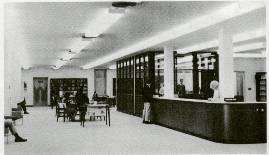
Circulation Desk and Browsing Area

The beautiful foyer with its free-hanging stairway is visual evidence of the wonders that can be worked in metal, stone and wood by modern architects and craftsmen. It is a fitting entrance to the air-conditioned beauty and utilitarian interior of a building that will enhance study and learning for thousands of young Kentuckians in the years to come.